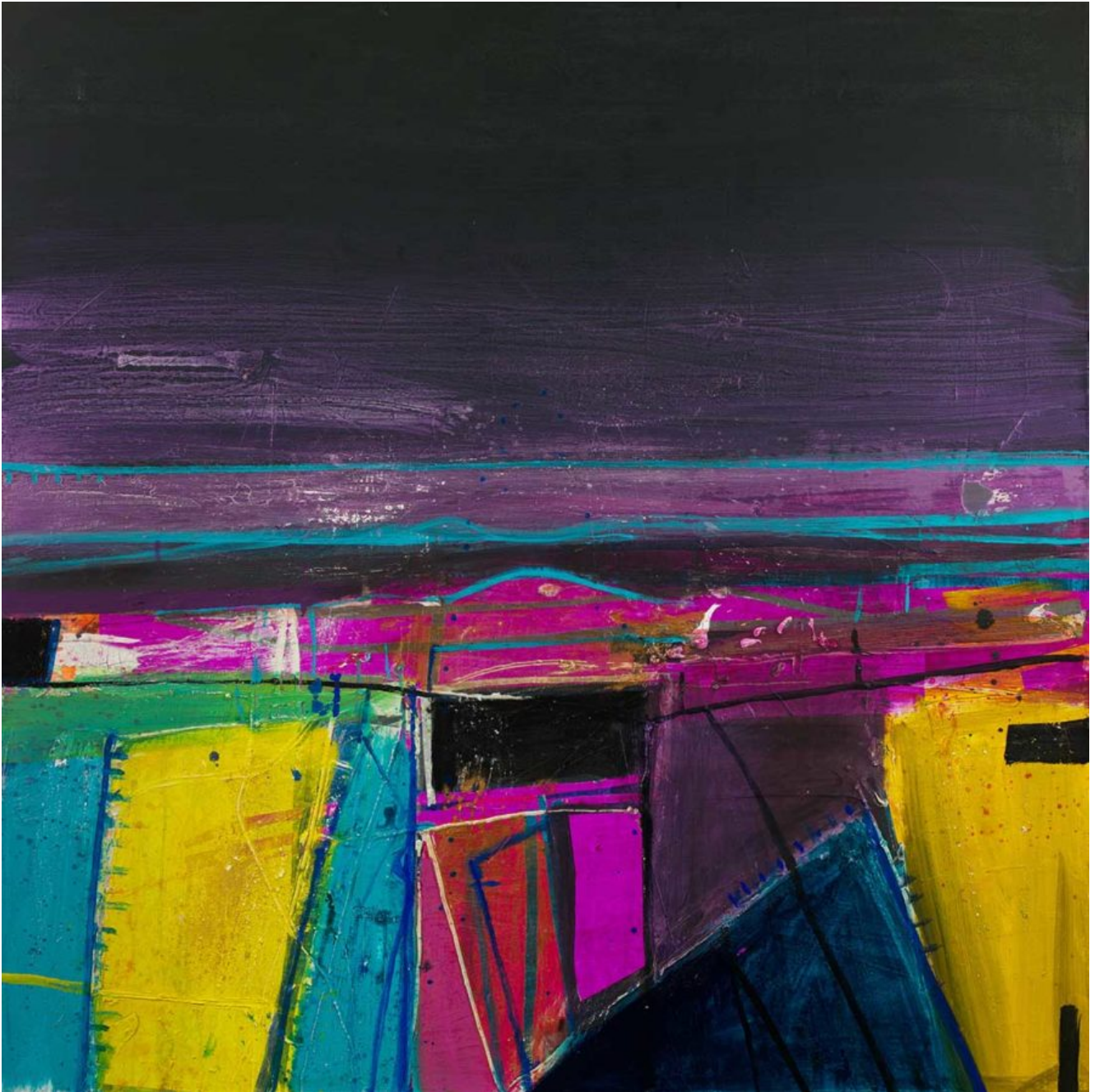
Weather Law , mixed media on canvas, 150 x 150 cm