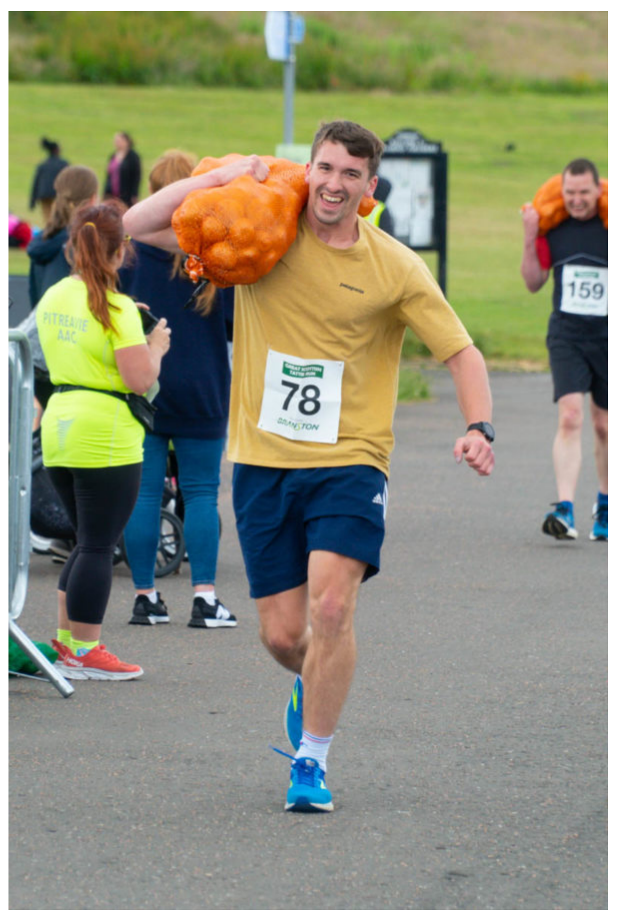
The Great Scottish Tattie Run is back after a three year absence and more than 300 participants are expected to race with a 20kg sack of Branston Potatoes on their back. PHOTO