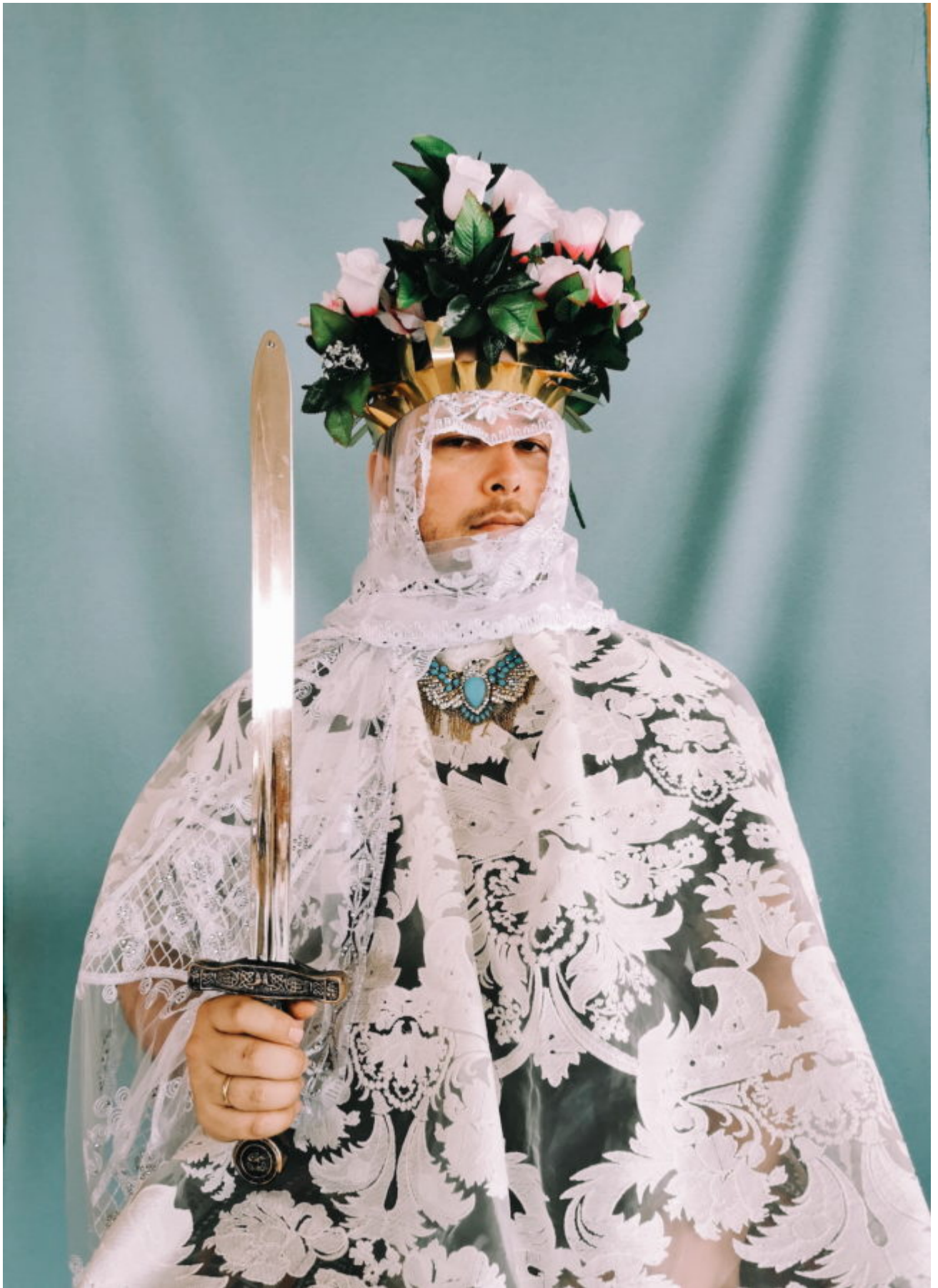
Sierra Metro StudioLenca