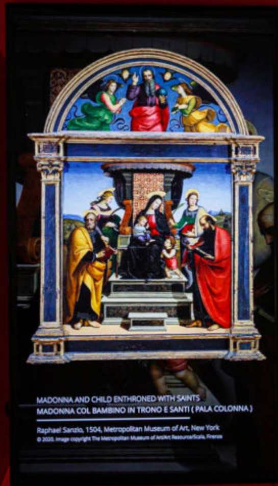
MADONNA AND CHILD ENTHRONED WITH SAINTS MADONNA COL BAMBINO IN TRONO E SANTI ( PALA COLONNA )

Raphael Sanzio, 1504, Metropolitan Museum of Art, New York