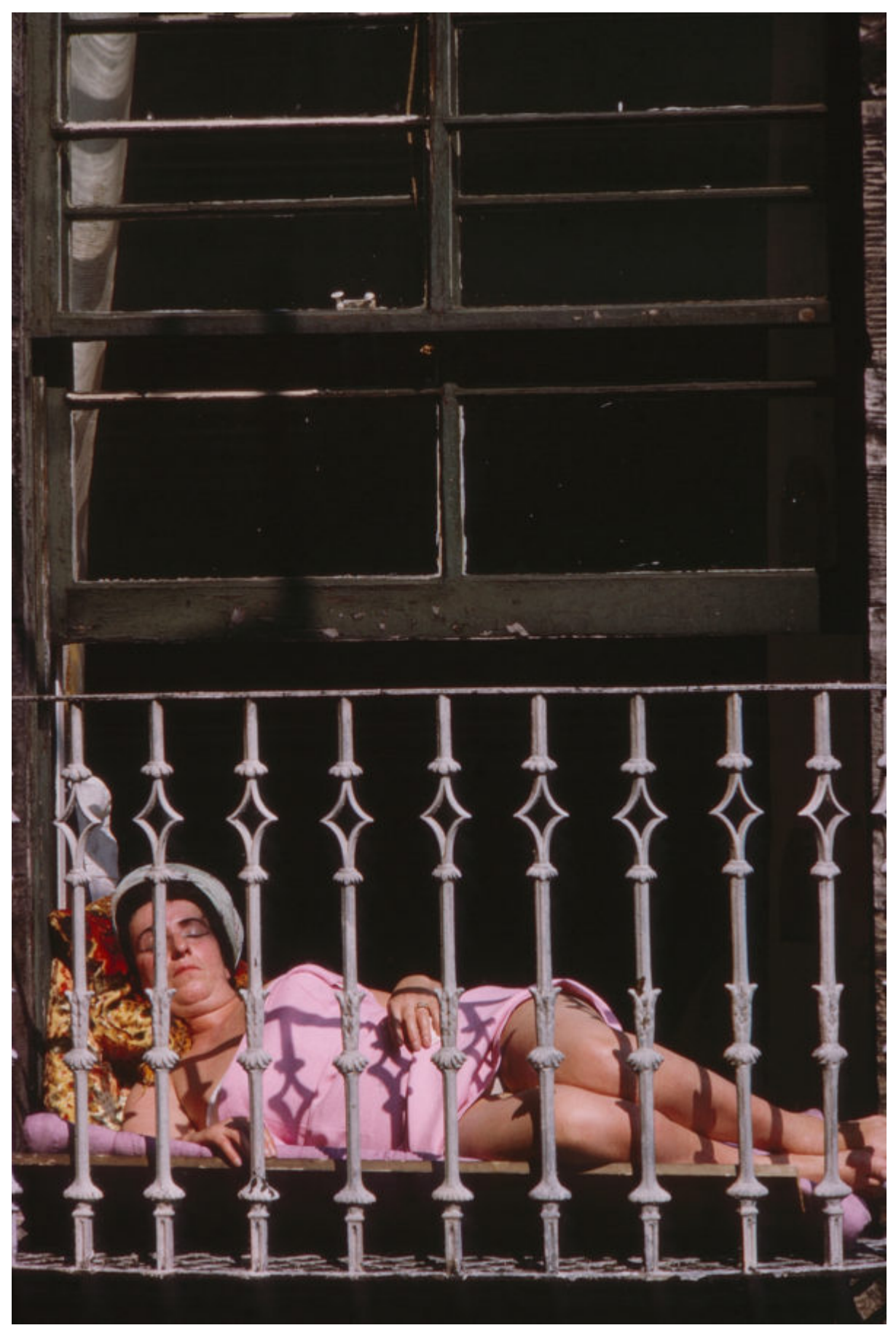
A Stockbridge sunbather