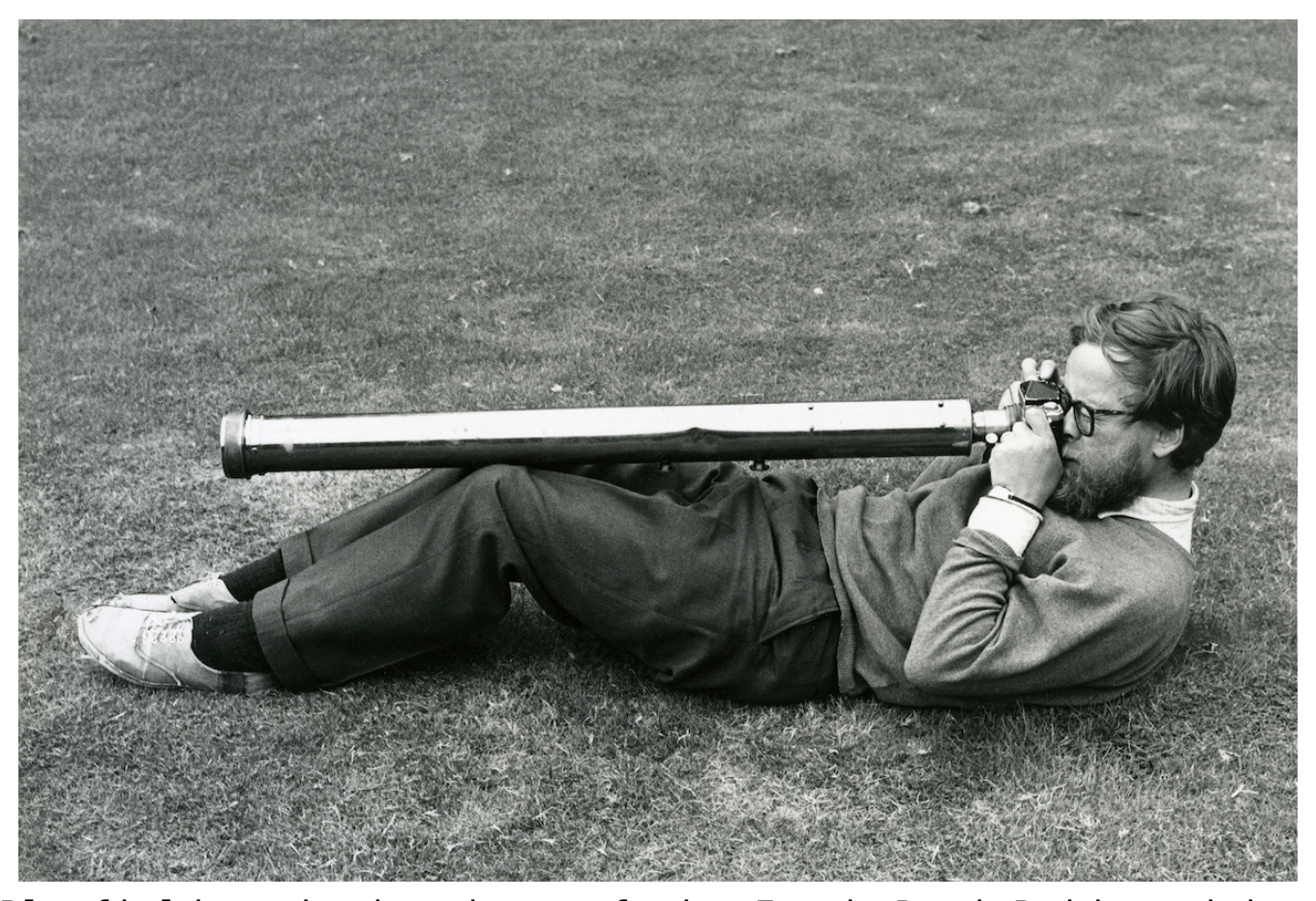
Blomfield took the photo of the Forth Road Bridge with a telescope

The newly completed Forth Road Bridge