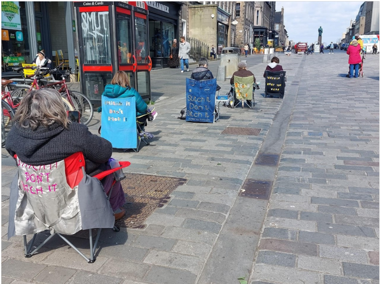
At a previous event in Castle Street