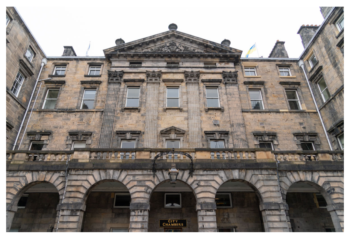
Edinburgh City Chambers.