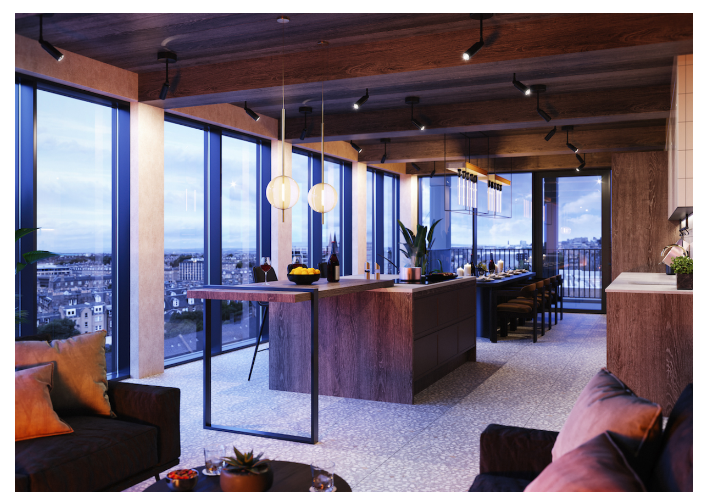
Private dining room