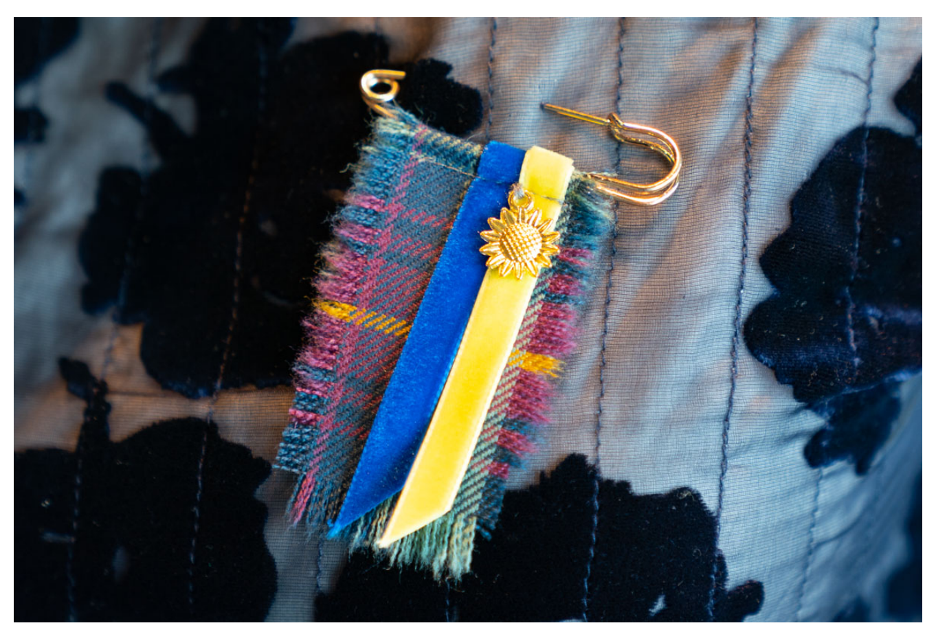
Hame Brooch.