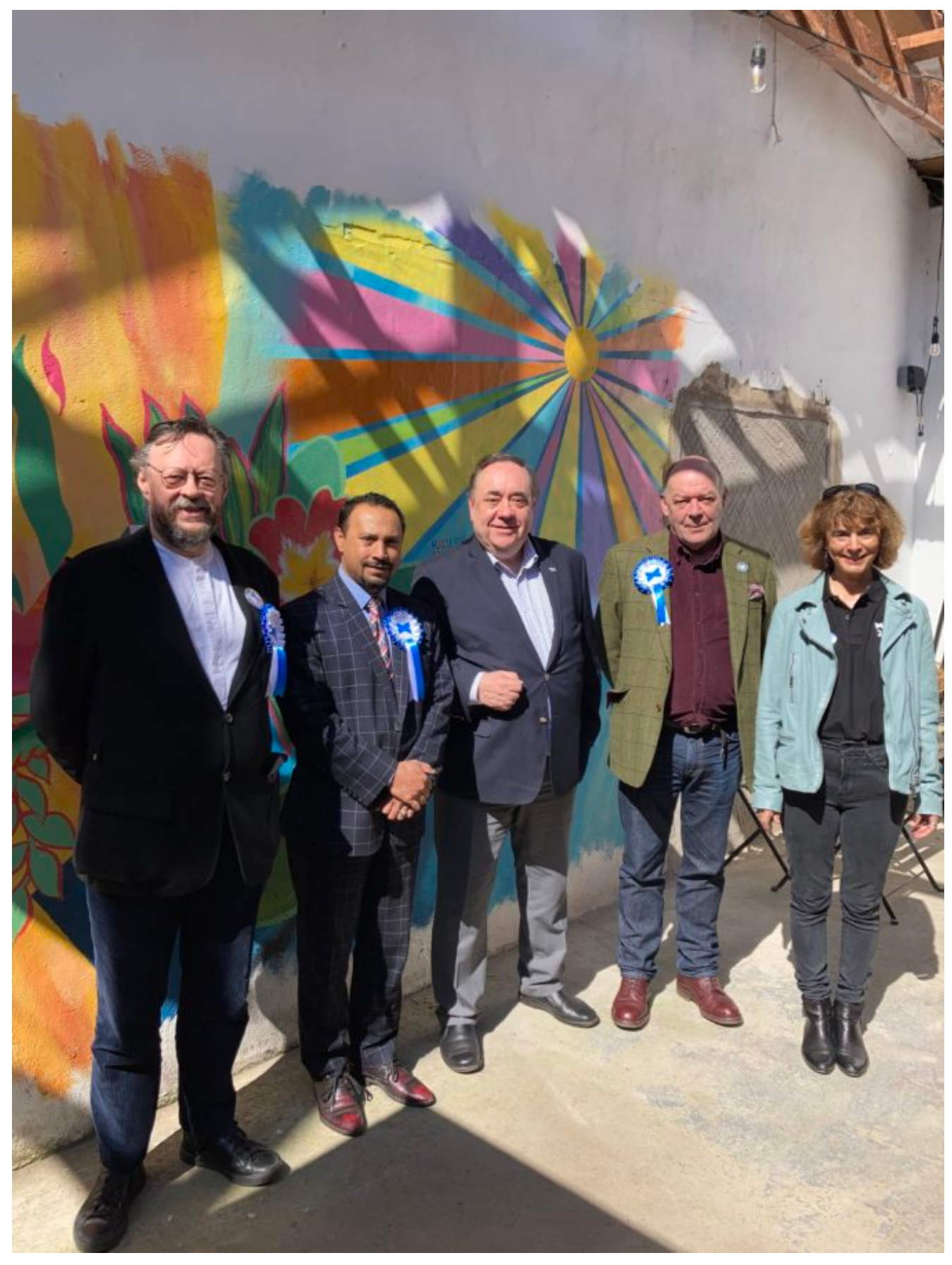
All the Alba Party candidates standing in Edinburgh are: