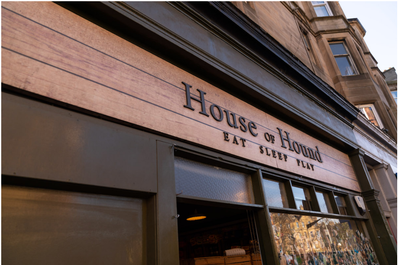
House of Hound, Roseburn.