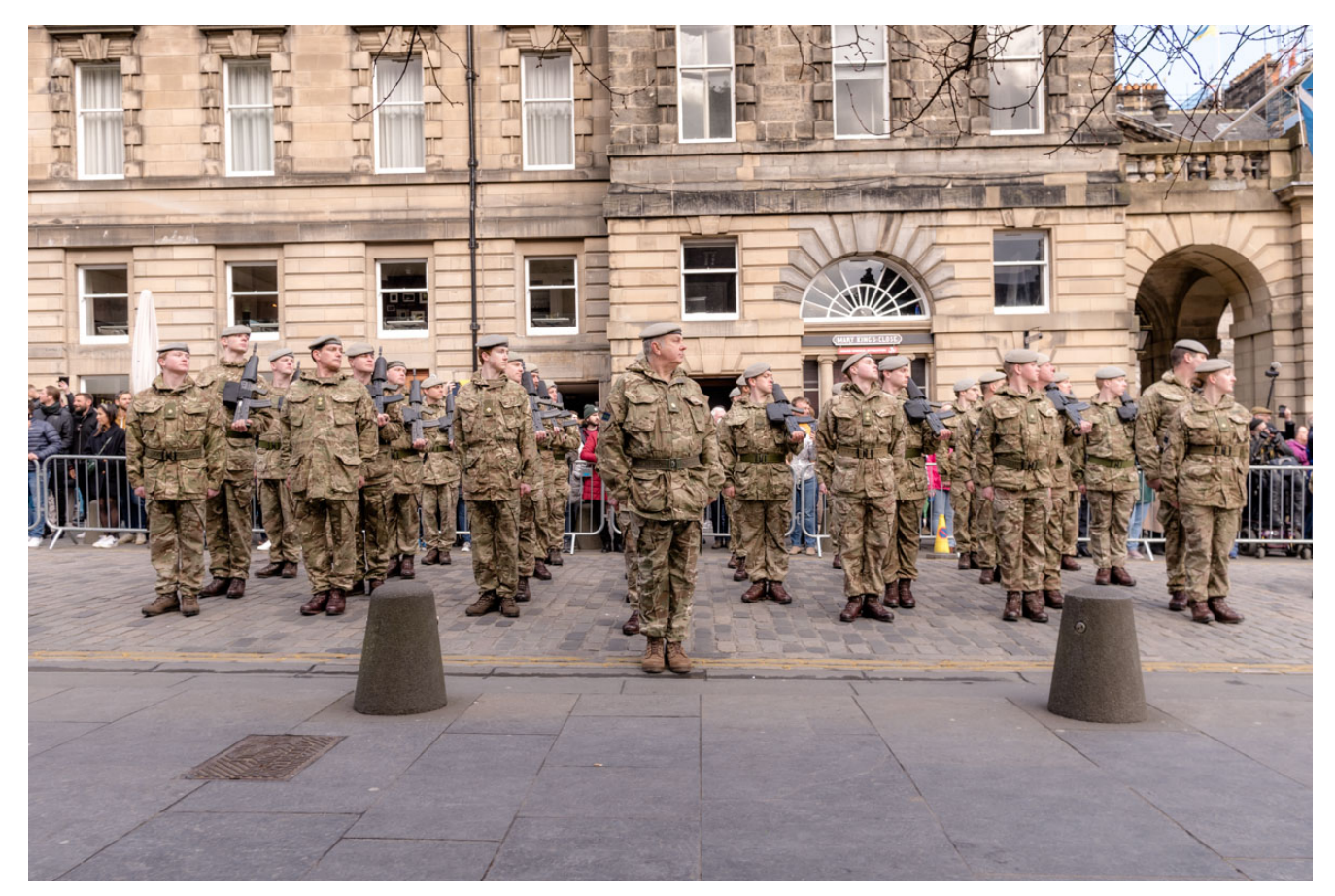
Scottish and North Irish Yeomanry