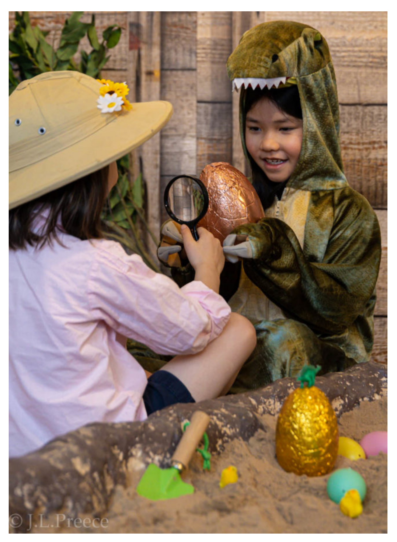
Dig Up a Dinosaur is one of the many fantastic activities available for children to experience at City Art Centre. For more information on City Art Centre and the wider Festival