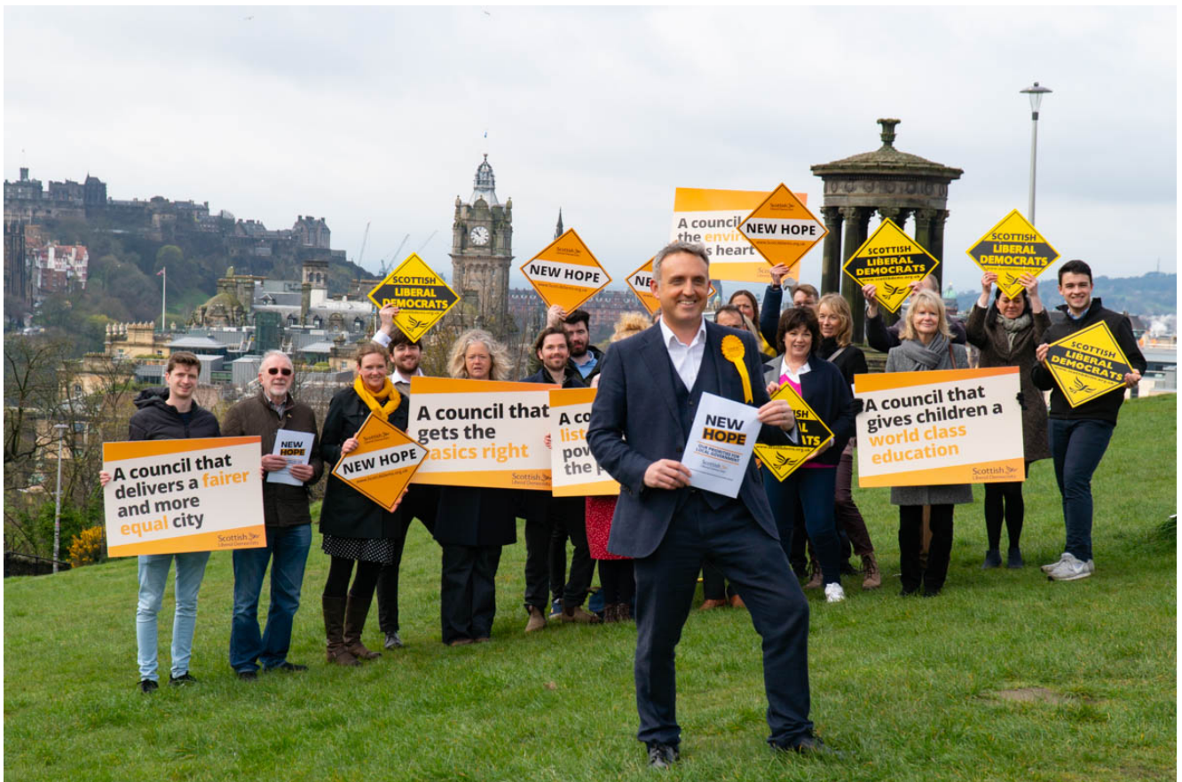
Liberal Democrat photo call on Calton Hill with some local

The 10-page document includes plans that the party says will ensure that every household benefits from a Cost of Living Rescue Package providing new hope to everyone worried about the crisis.