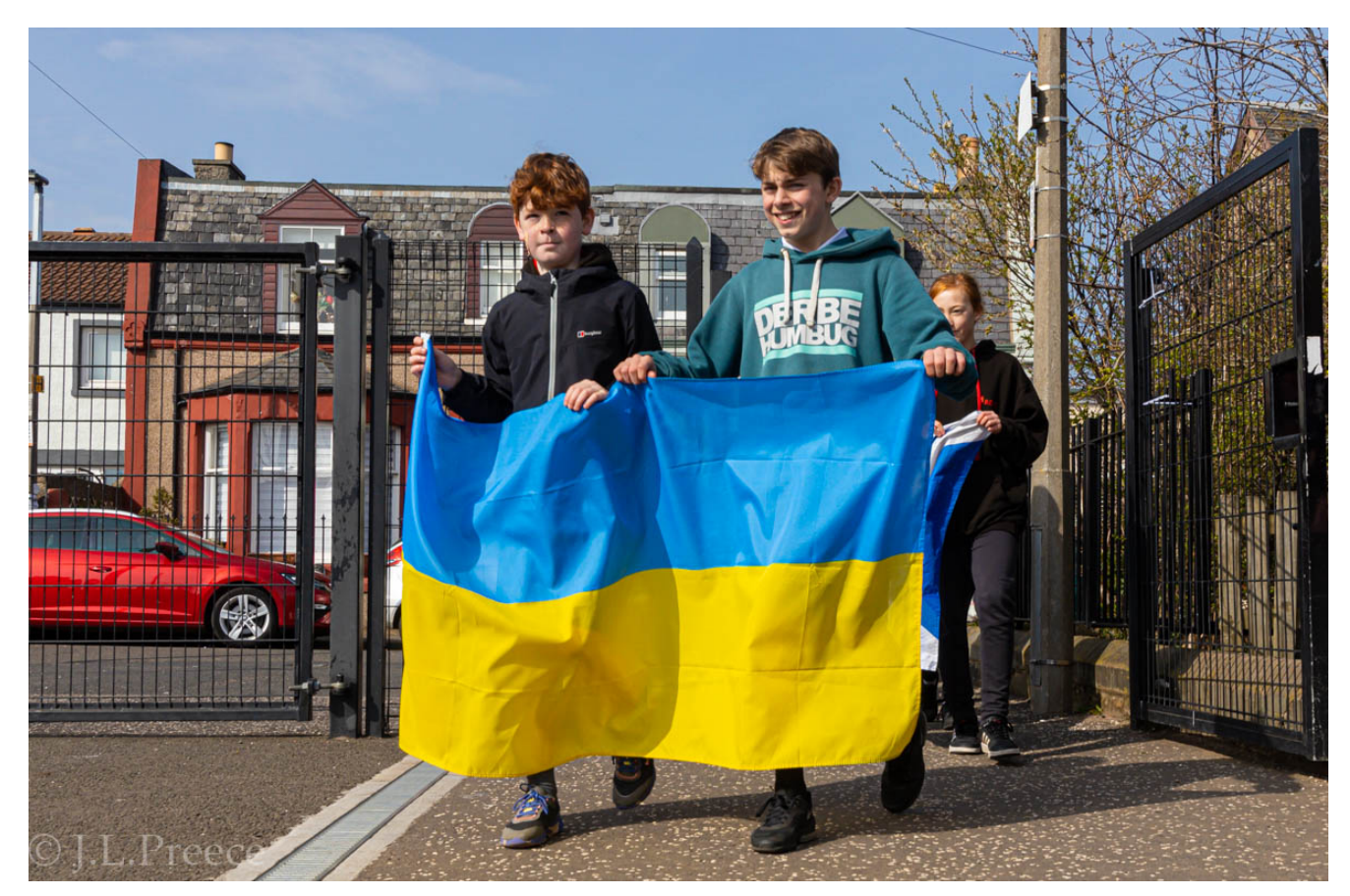
Back to school! Donating through JustGiving is simple, fast and totally secure. <a href="https://www.justgiving.com/fundraising/towerbank-primary-school-dec">https://www.justgiving.com/fundraising/towerbank-primary-school-dec</a>

They chose the Disasters Emergency Committee (DEC) because it is a coalition of 15 UK aid charities with lots of experience of raising funds and responding quickly and effectively to overseas disasters. They also like that it works not only in Ukraine but in many other countries suffering from war including Afghanistan, South Sudan, Syria, Myanmar and Yemen.