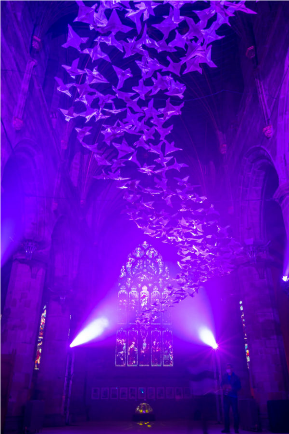
Art for Peace Project Les Colombes at St. Giles Cathedral.