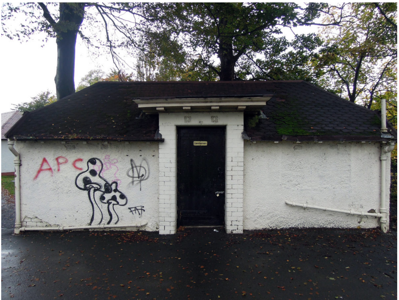
Before the graffiti was removed

“Additionally, income from the cafe will help to support other projects led by the Friends of Roseburn Park to improve the overall amenity and quality of the Park.”