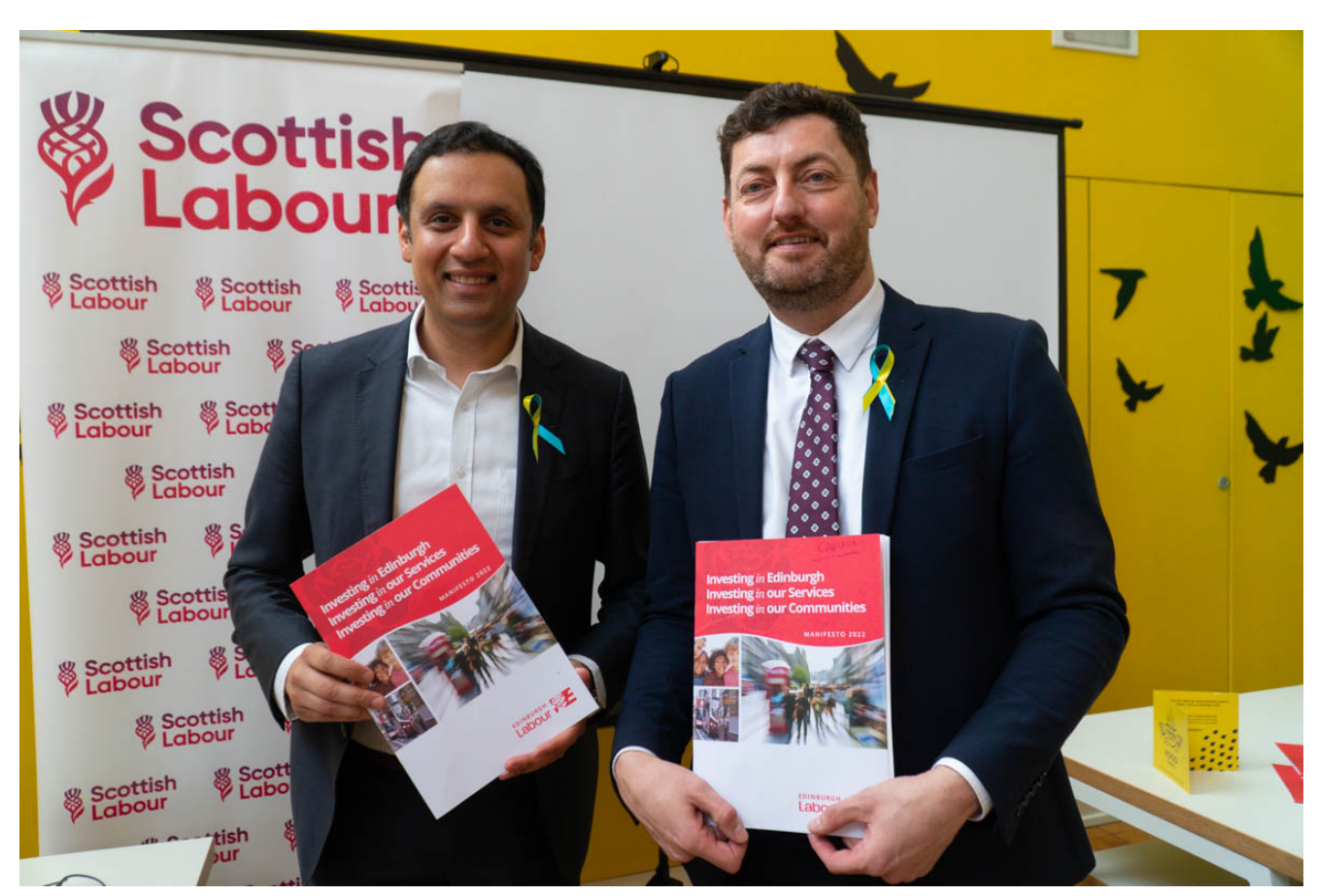
Launch of 2022 Edinburgh Labour Manifesto at Coffee Saints

"This is a manifesto full of ideas, it is credible and deliverable and will make a massive difference to this great city, one of the world-class cities of course."