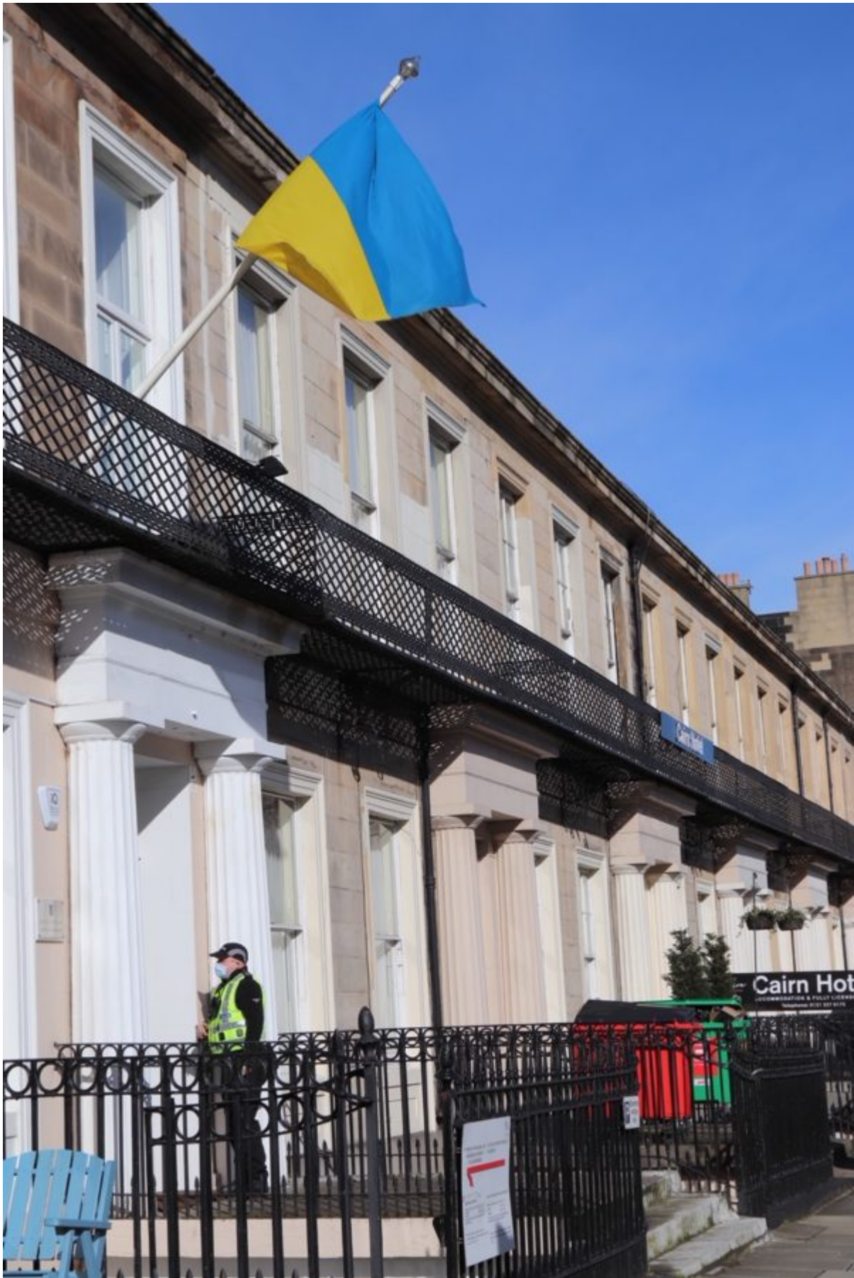
A police officer attending the Ukrainian Embassy on Thursday morning