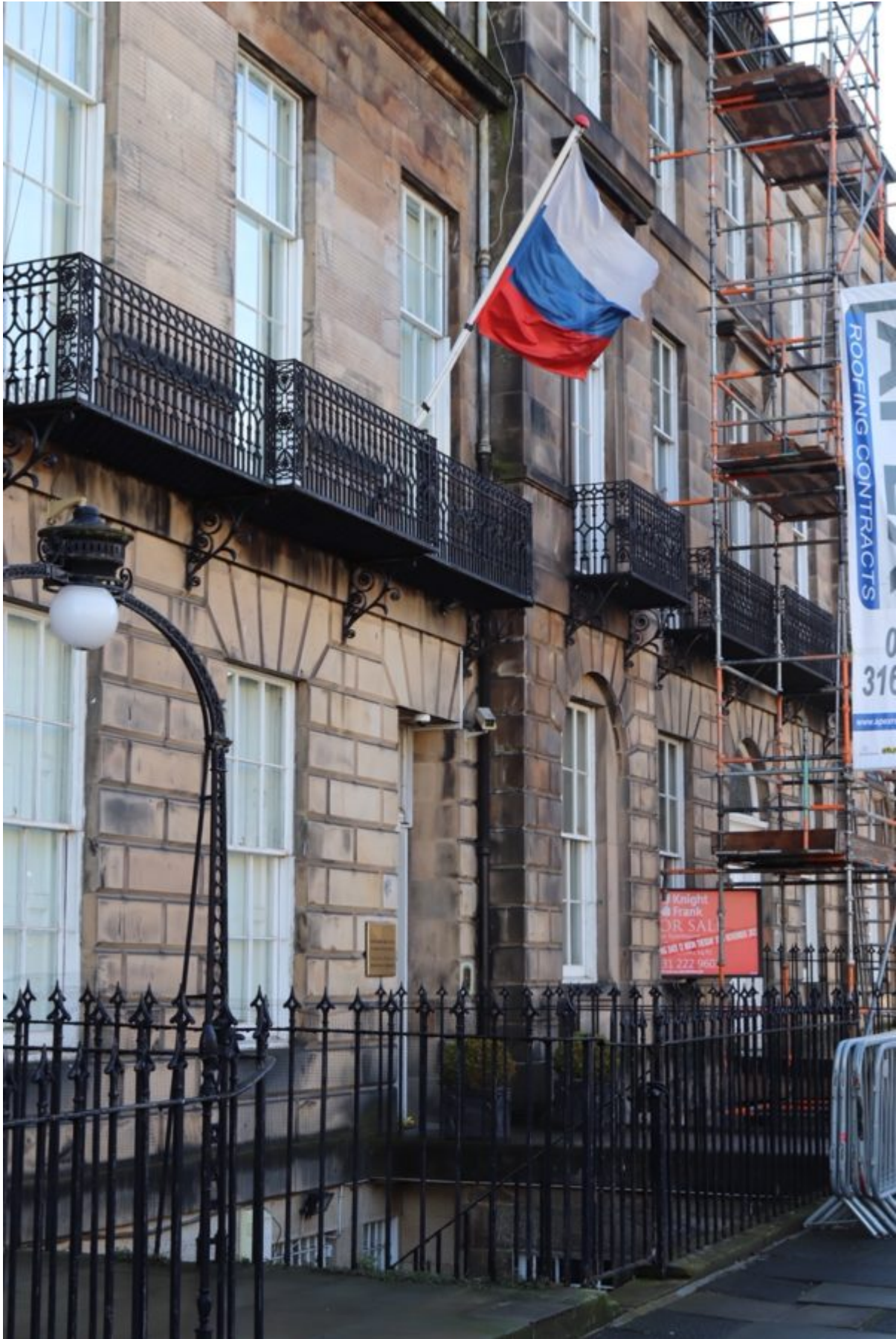
The Russian Consulate on Melville Street on Thursday morning.