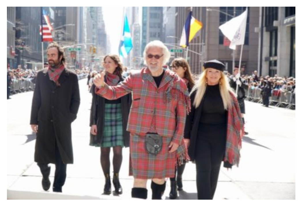
Sir BIlly Connolly strode the whole way down Sixth Avenue with his family in support

accompanied him to judge the dogs competition and take the salute on Sixth Avenue as the parade passed by.