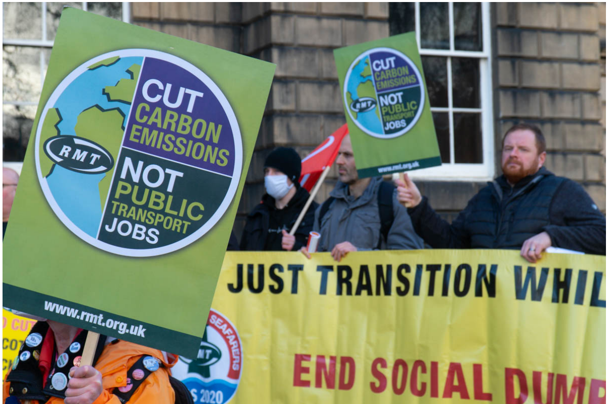
RMT Union protest about lack of action since COP26 by parading from Waverley to Bute House