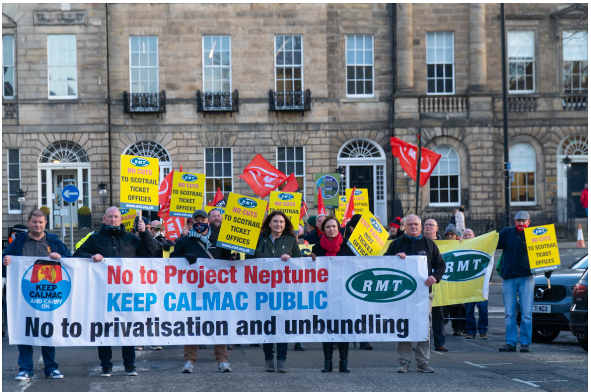
RMT Union protest about lack of action since COP26 by parading from Waverley to Bute House