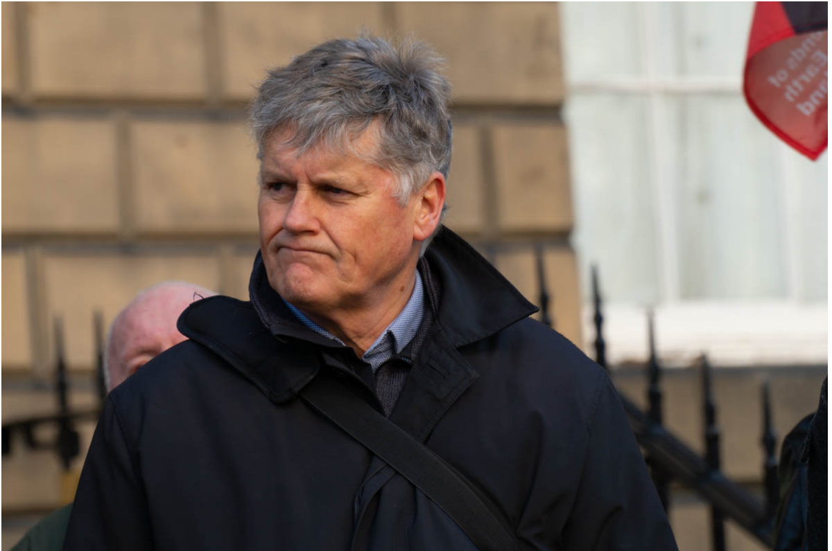
RMT Union protest about lack of action since COP26 by parading from Waverley to Bute House