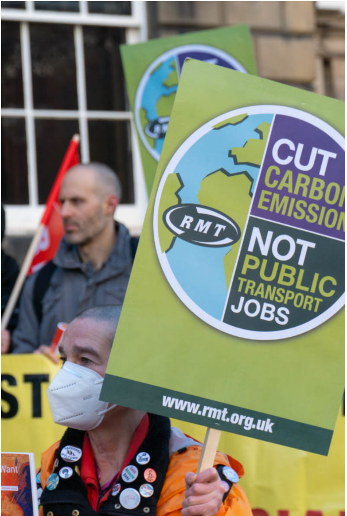
RMT Union protest about lack of action since COP26 by parading from Waverley to Bute House