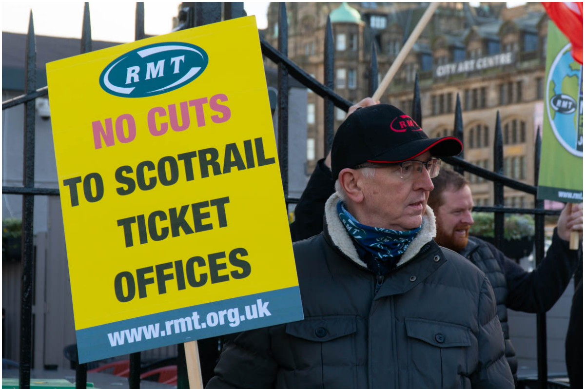
RMT Union protest about lack of action since COP26 by parading from Waverley to Bute House