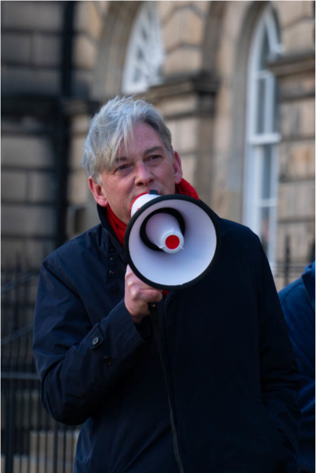
RMT Union protest about lack of action since COP26 by parading from Waverley to Bute House