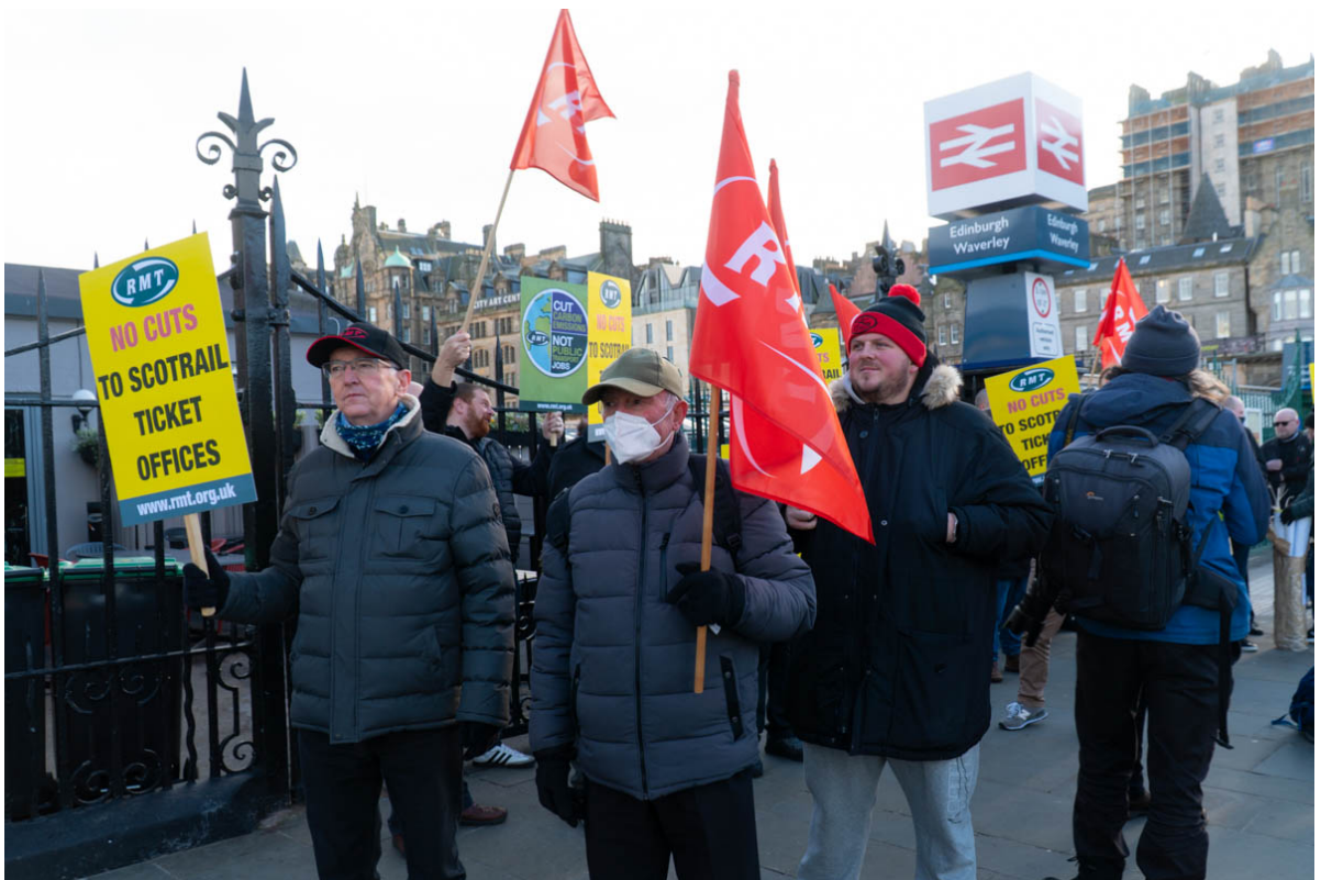
RMT Union protest about lack of action since COP26 by parading from Waverley to Bute House