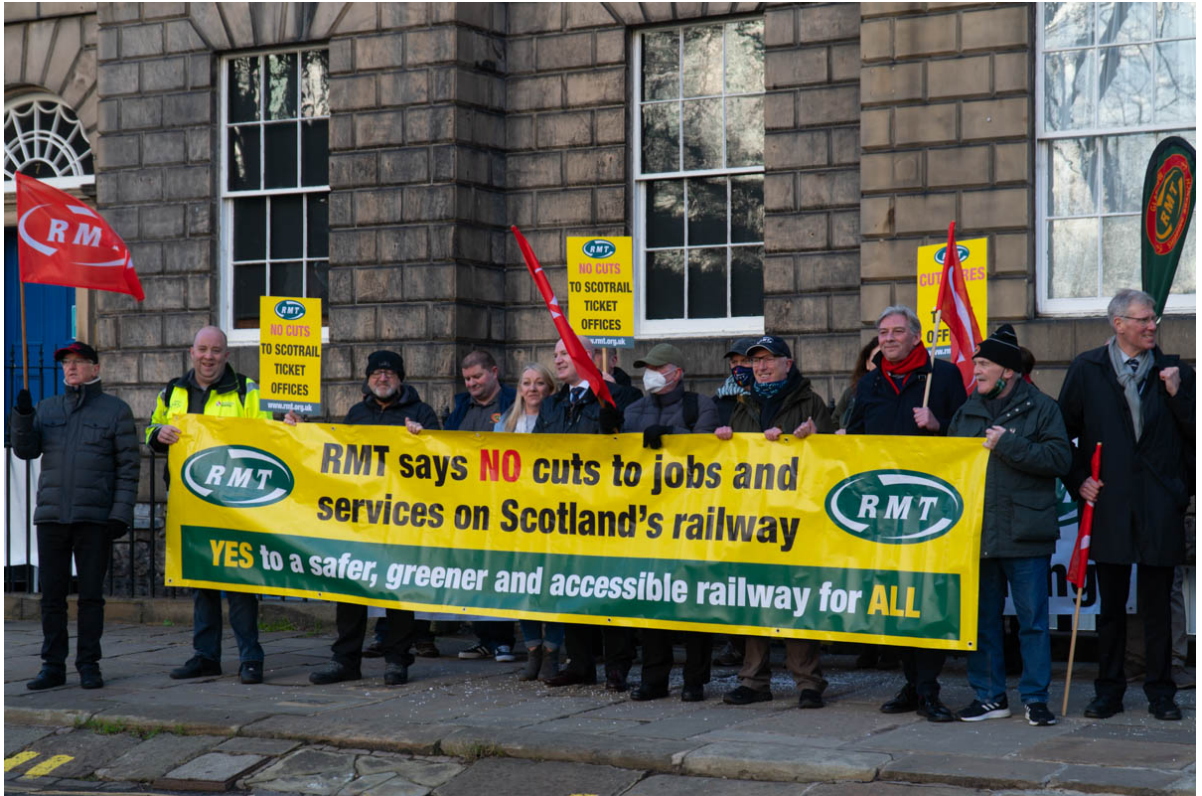
RMT Union protest about lack of action since COP26 by parading from Waverley to Bute House