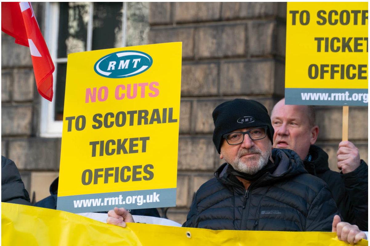
RMT Union protest about lack of action since COP26 by parading from Waverley to Bute House