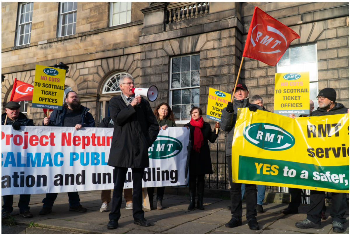
RMT Union protest about lack of action since COP26 by parading from Waverley to Bute House

the First Minister's official residence at Bute House.