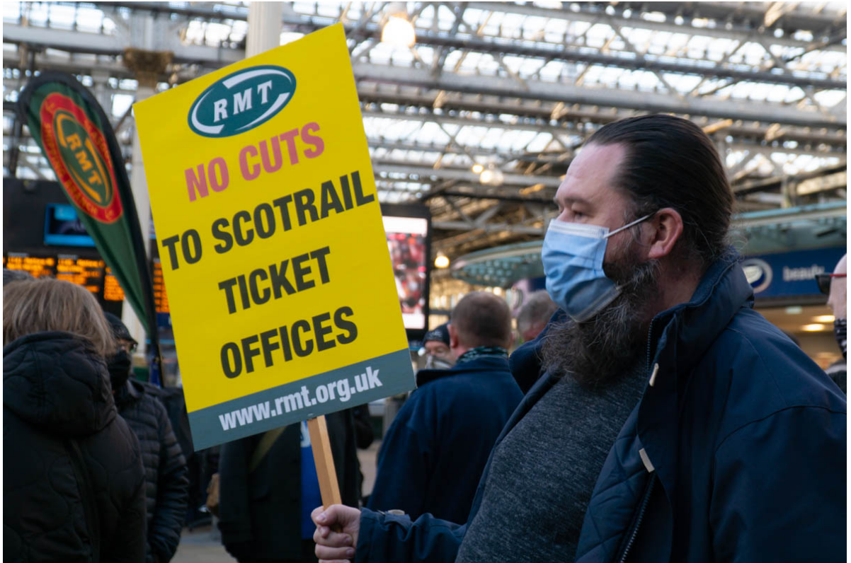
RMT Union protest about lack of action since COP26 by parading from Waverley to Bute House