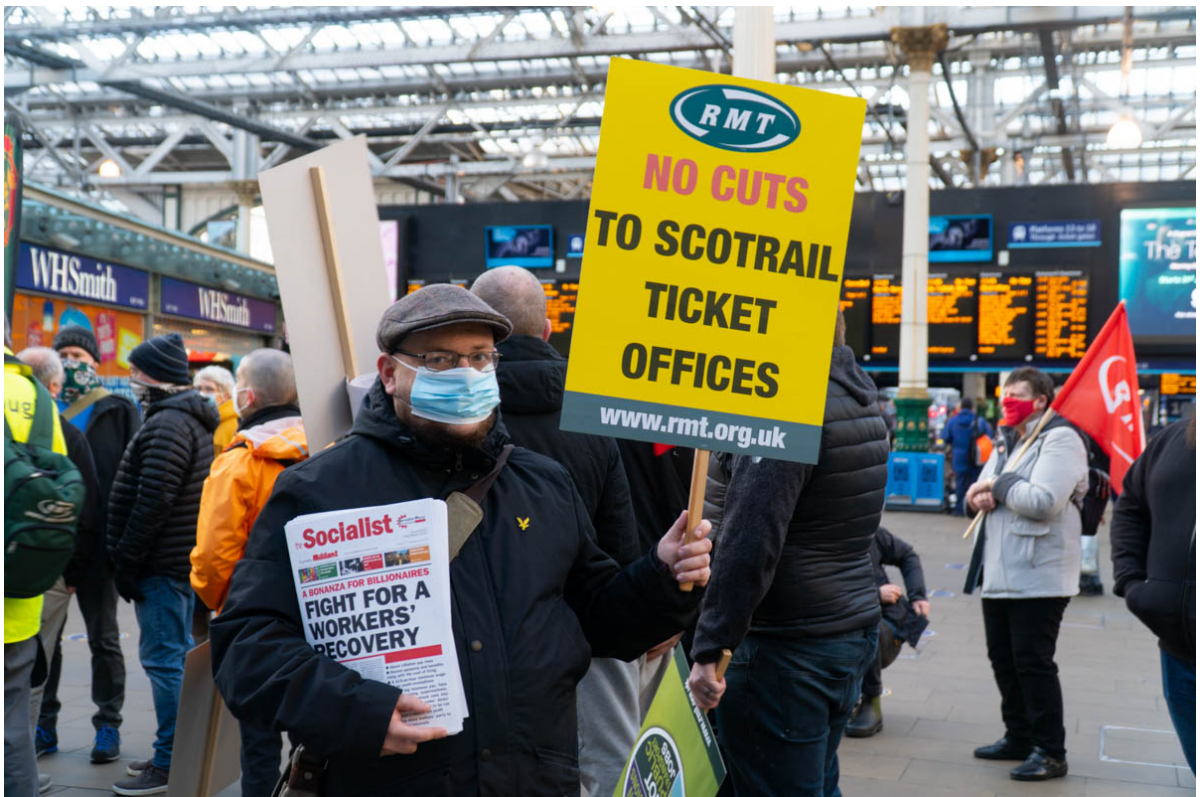
RMT Union protest about lack of action since COP26 by parading from Waverley to Bute House