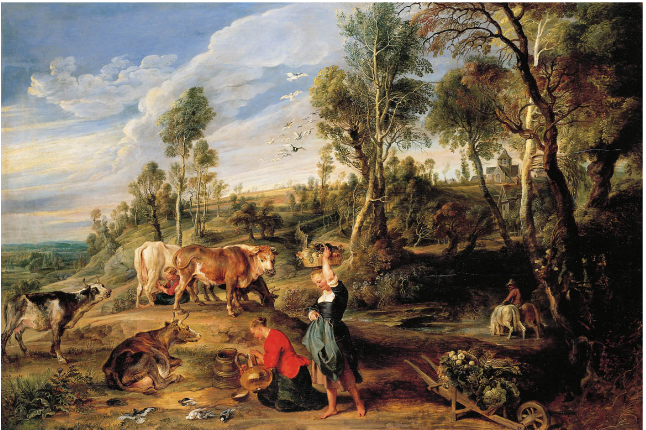
Two atmospheric landscapes painted in Italy will be on display in Scotland for the first time. The diffuse golden light and