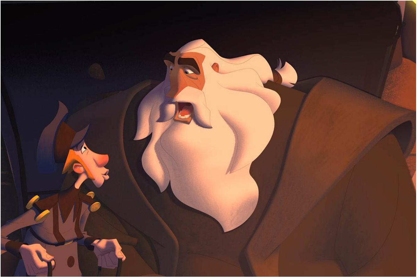
Campeones and Klaus

“The festival team are extremely grateful to the institutions that have helped us to create a platform where Spanish and British industry professionals can meet.”