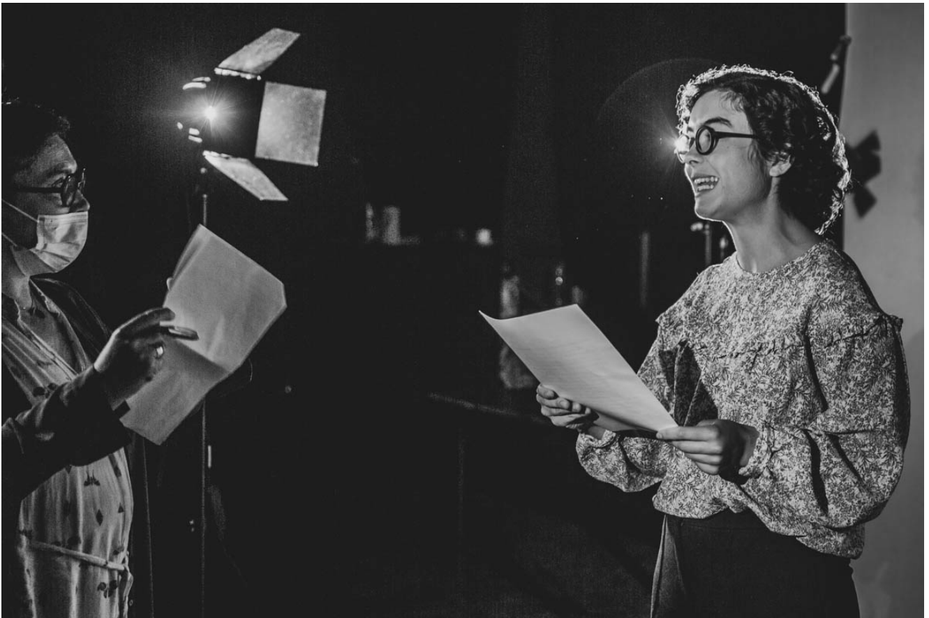
Latin Noir – Havana and Cartas Vivas.

The festival will feature a great selection of theatrical