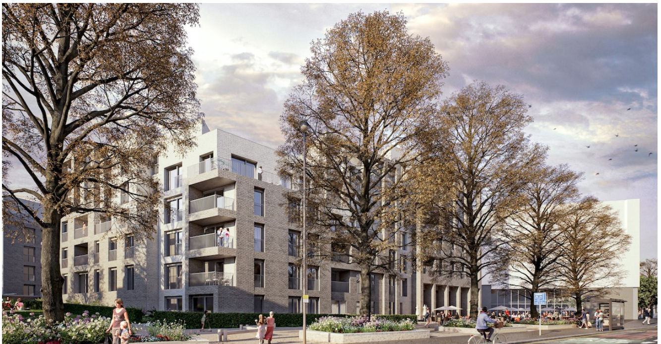
Meadowbank