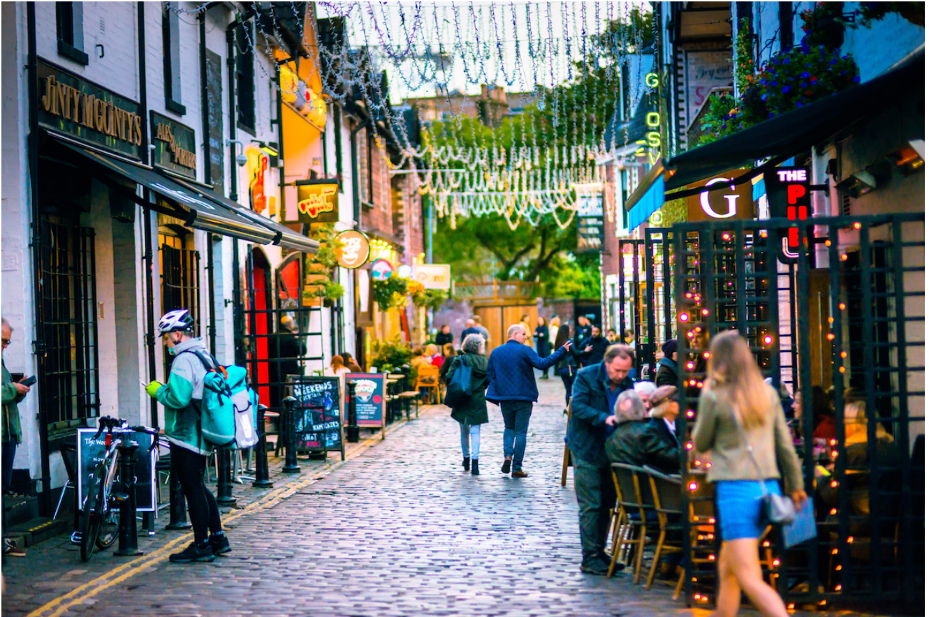
Ashton Lane in Glasgow's West End

position as a “world leader in the race to net zero and a place where green business can be done”.