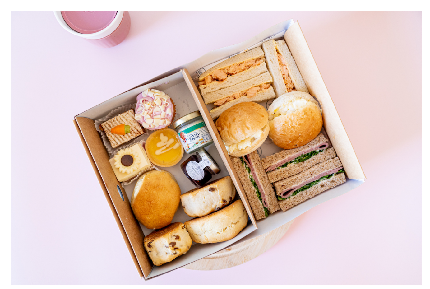
Social Bite picnic afternoon teas

For more information and orders visit the website on <a href="https://shop.social-bite.co.uk/product/afternoon-tea/">https://shop.social-bite.co.uk/product/afternoon-tea/</a>