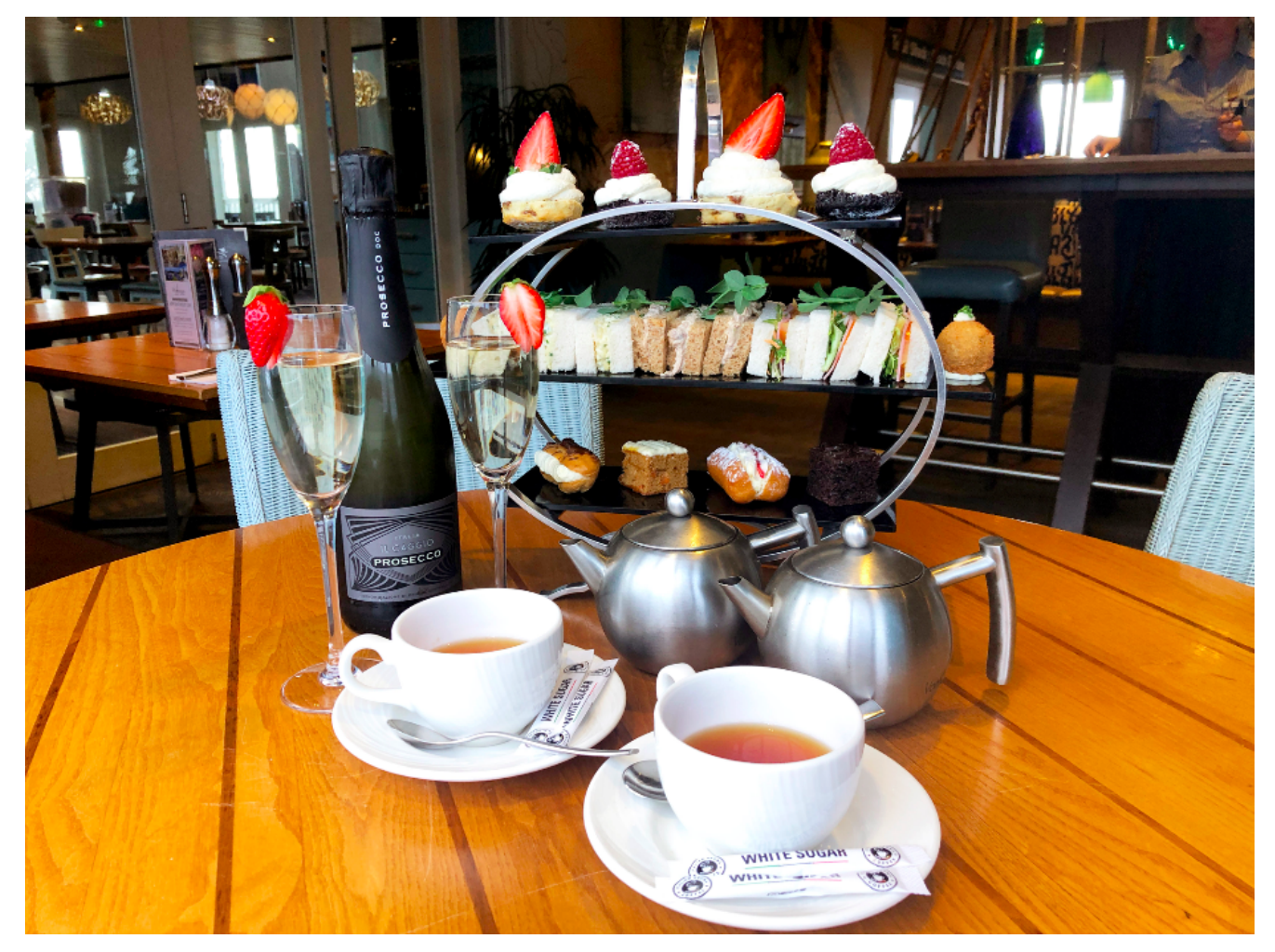
<u>Social Bite – Afternoon tea for two</u>

For more information and reservations visit the website