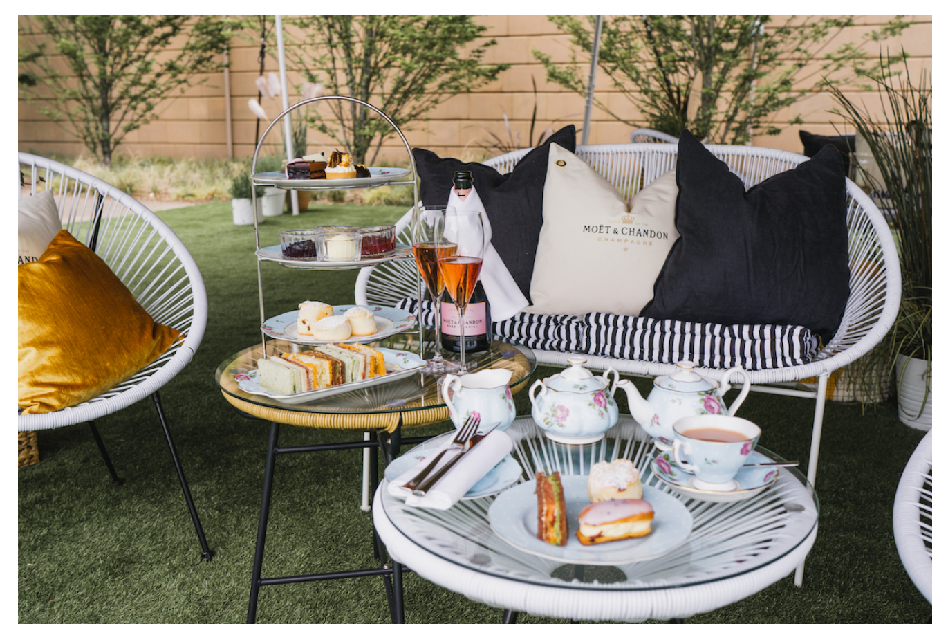
Fairmont St Andrews <u>Ness Walk – Heavenly afternoon tea</u>