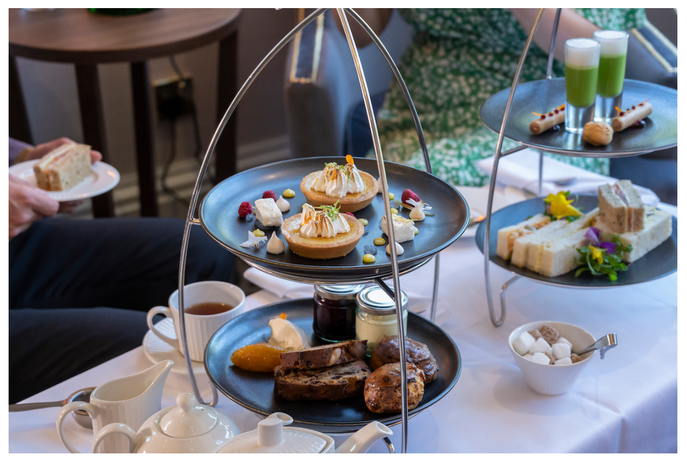
<u>The Torridon Hotel – The Torridon afternoon tea</u>

For more information and reservations visit the website