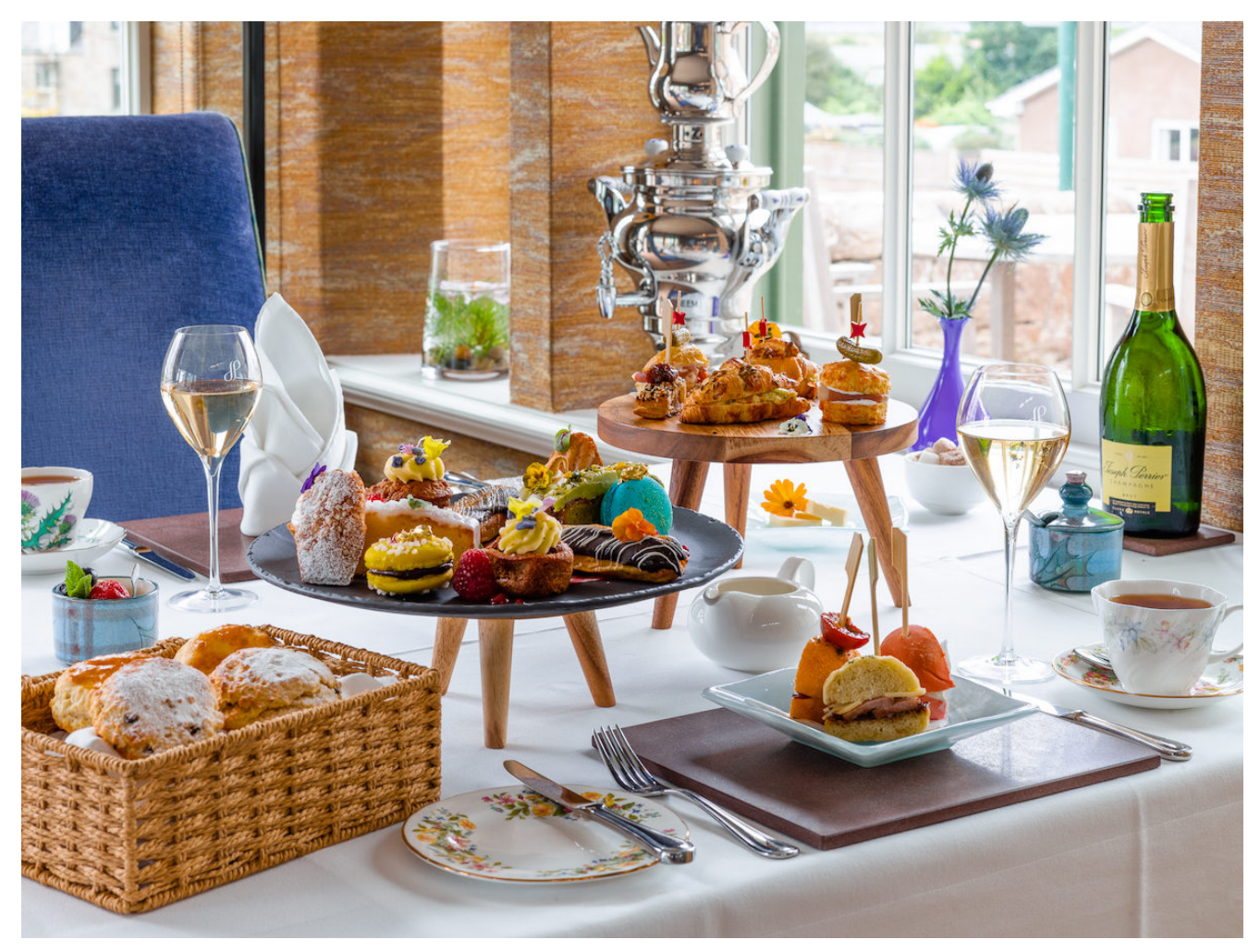
The Storehouse – Adult and children's afternoon tea

For more information and reservations visit the website