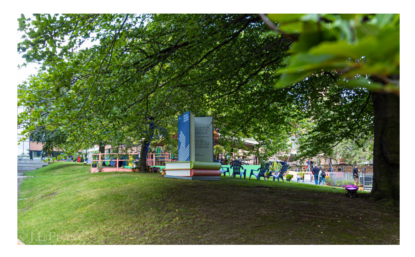
The new, open for all to see, photography area. No skulking away this year...