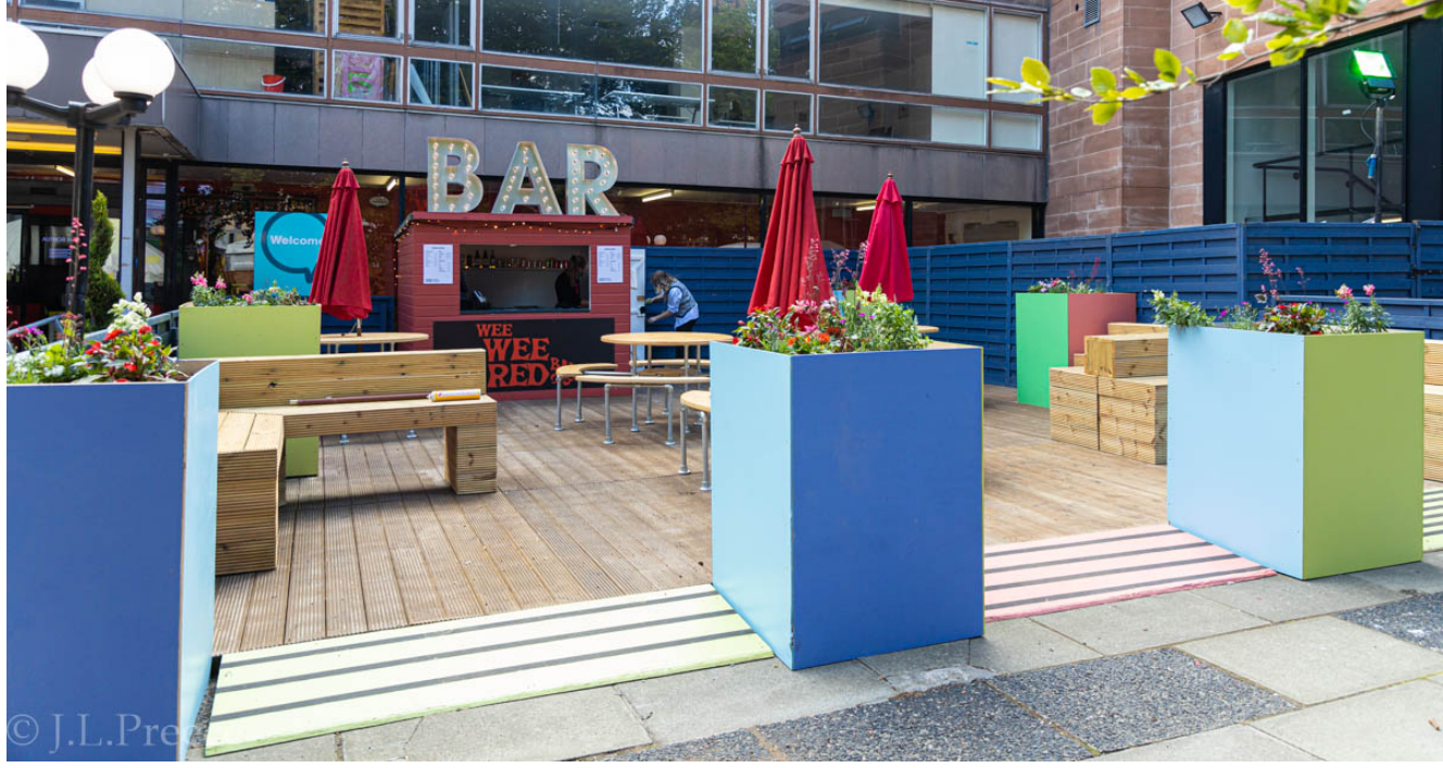
Some of those refreshment areas.

Oh, and the shop is now indoors in the old Fire Station.