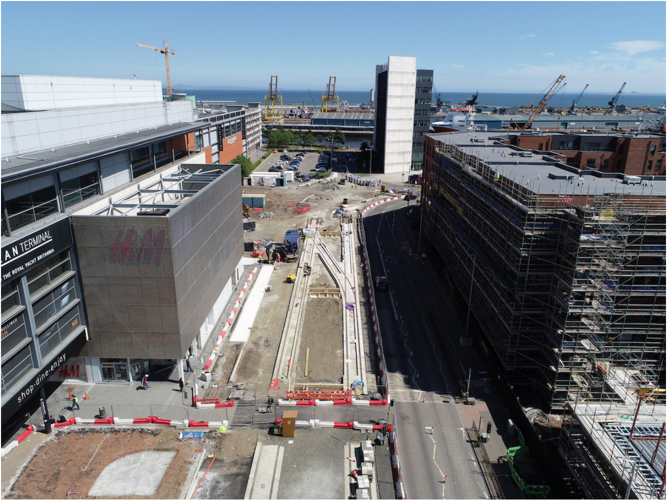
Here you can see the Ocean Terminal landscaping works