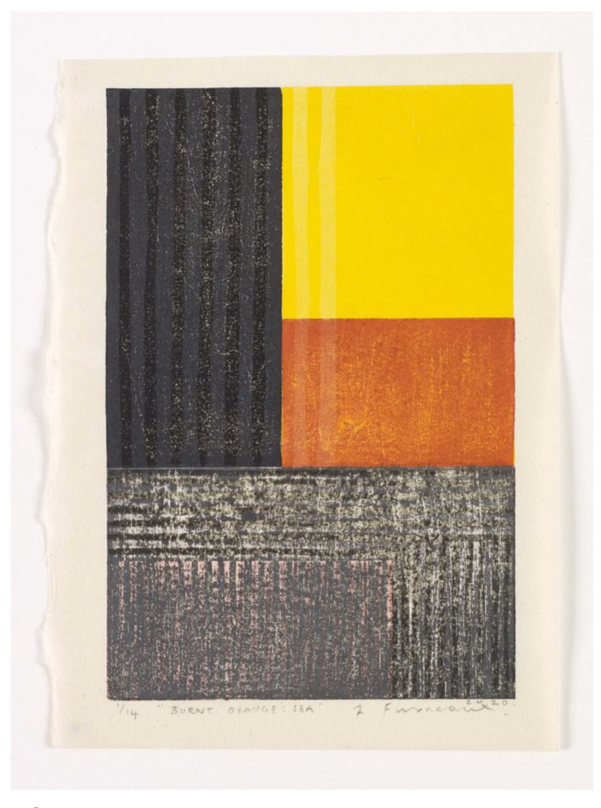
Paul Furneaux RSA Burnt Orange Sea