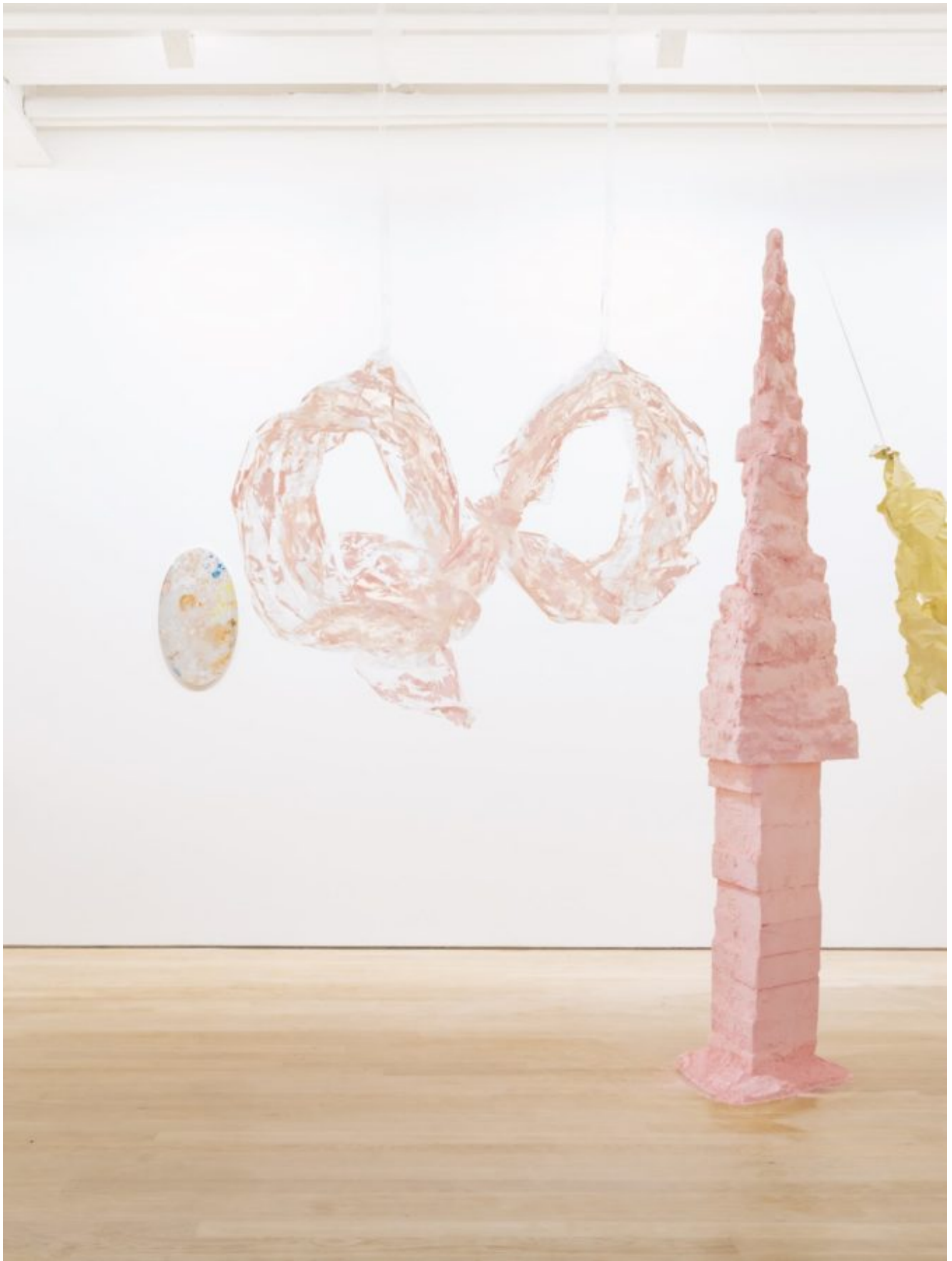
Installation view: Karla Black: Sculptures (2001–2021) details for a retrospective (from left to right): Looking Glass number 7, 2021, Courtesy the artist and Galerie Capitain, Cologne.