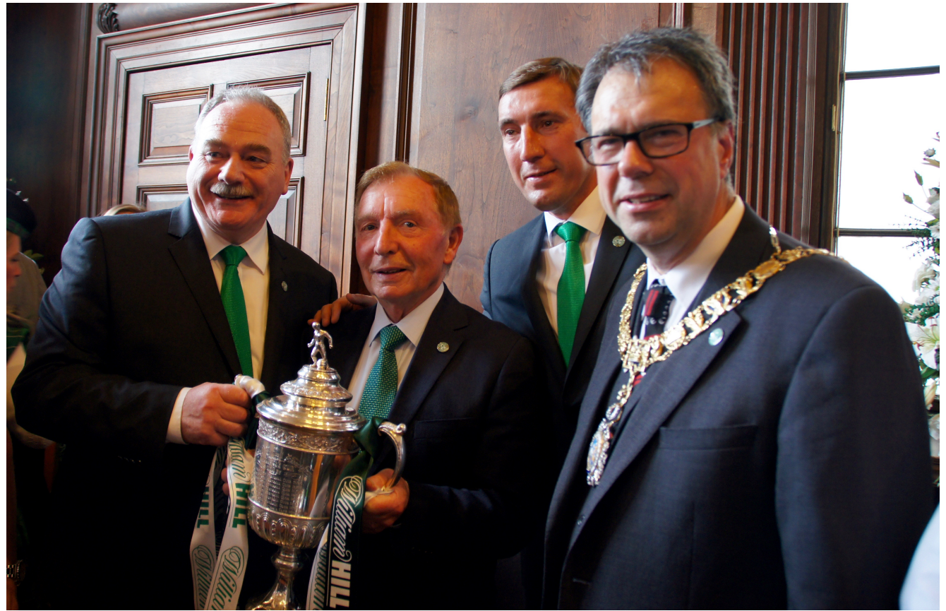
"We've not been to the final since but we want to make that next step again. It's time for new people to step up and become legends."