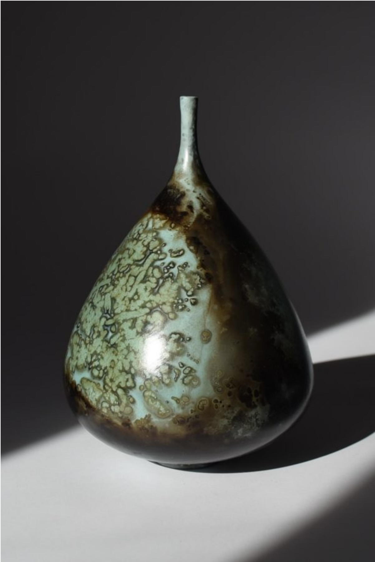
Medium 'droplet' narrow necked vessel Smoke fired ceramics JW15A -19.5cm tall