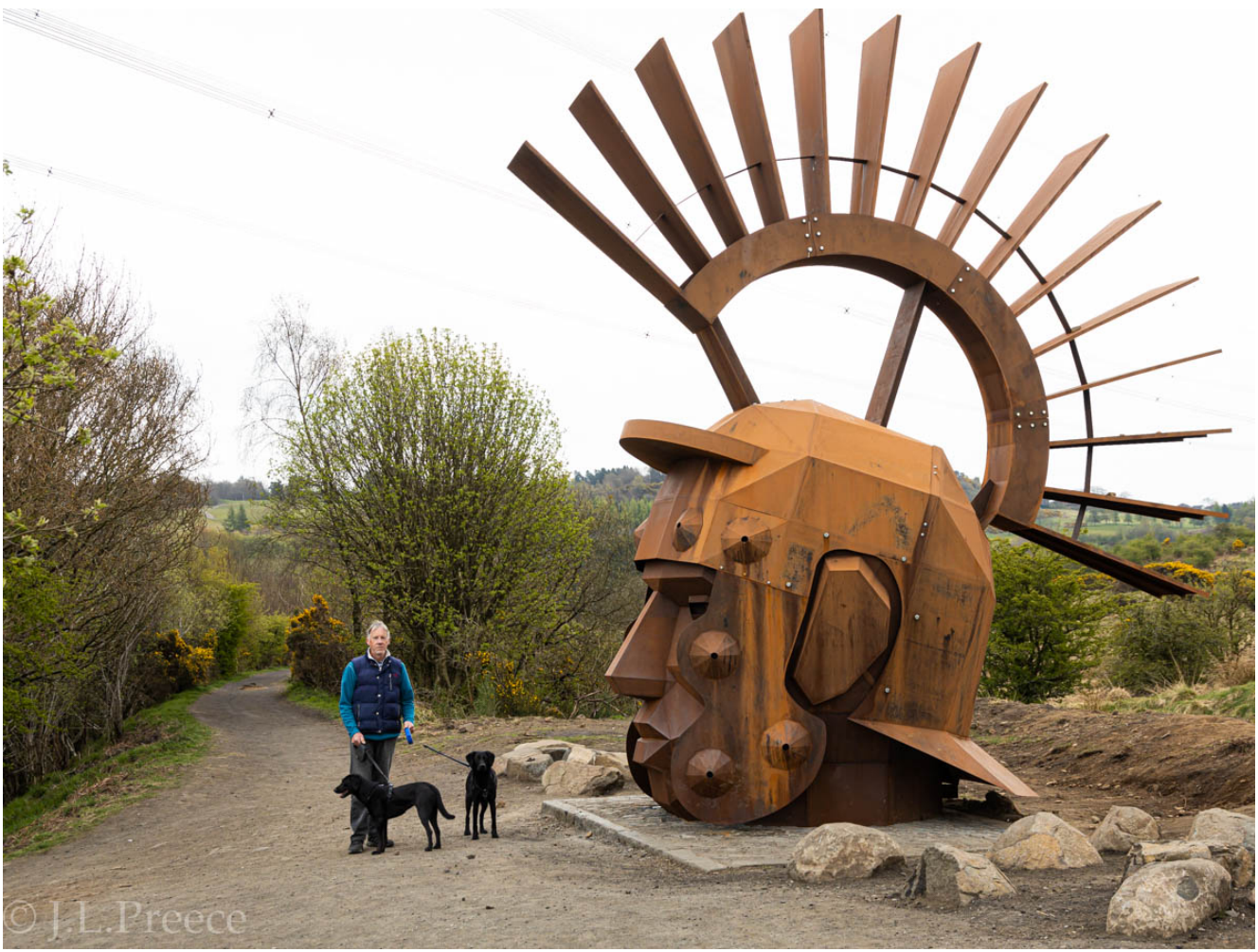
Master of all he surveys...