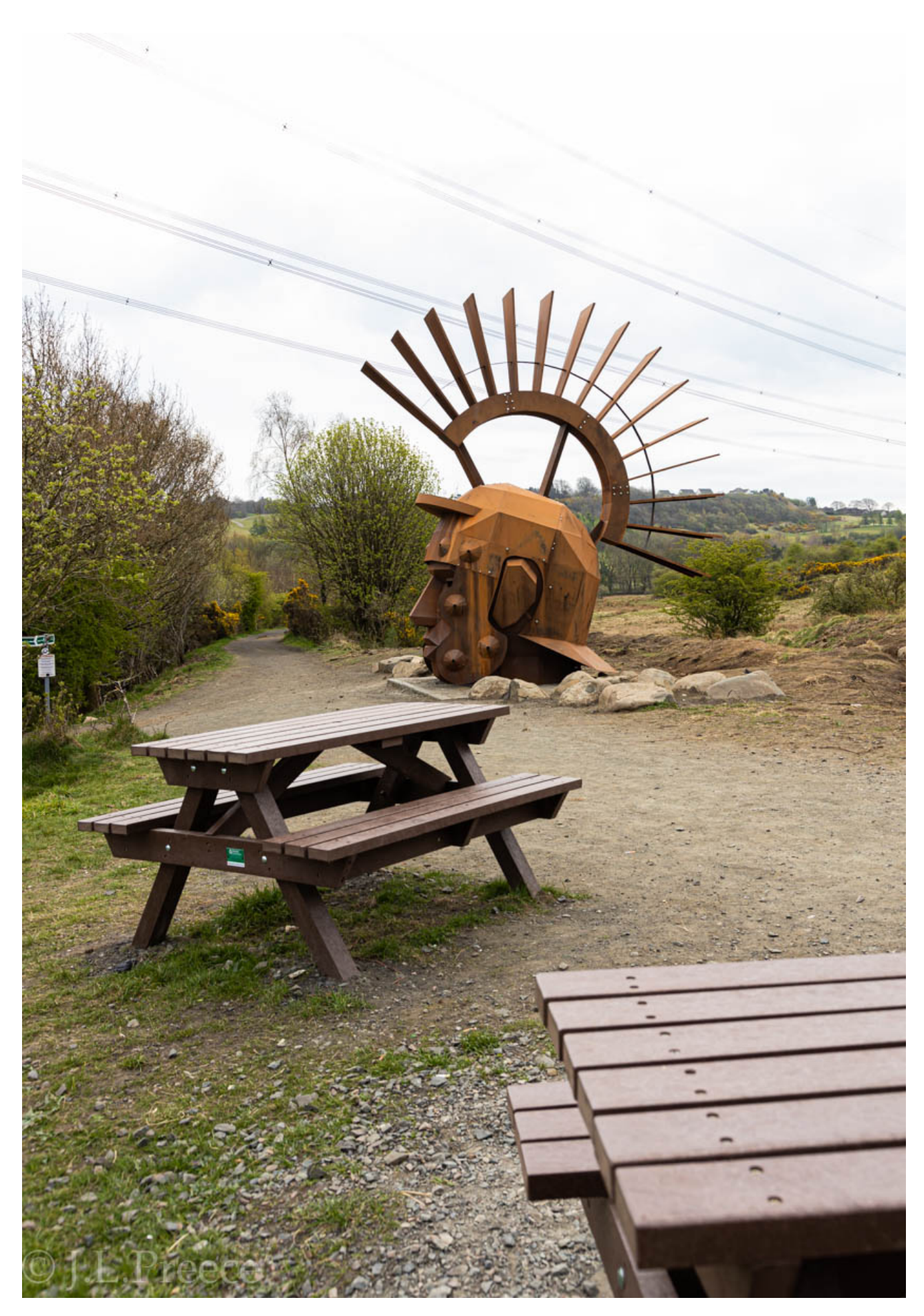
'Silvanus' finally 'open' to the public