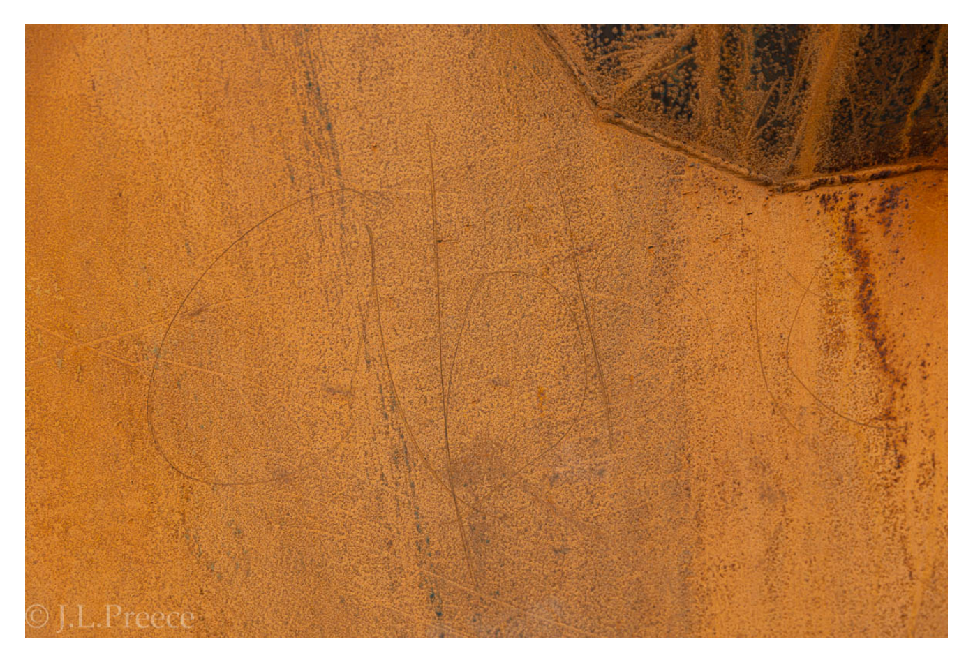
The steel plate has already been tagged by the locals

There will be an official opening ceremony taking place within the next couple of months, but the Covid 19 situation meant that everything had to be put on hold until opening up details had been published.