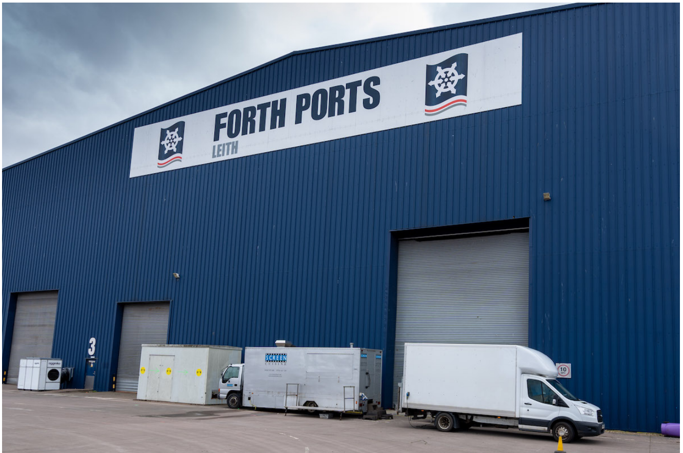
Forth Ports, Edinburgh Studio.

A release date is yet to be announced for The Rig which will be available on Amazon Prime Video.