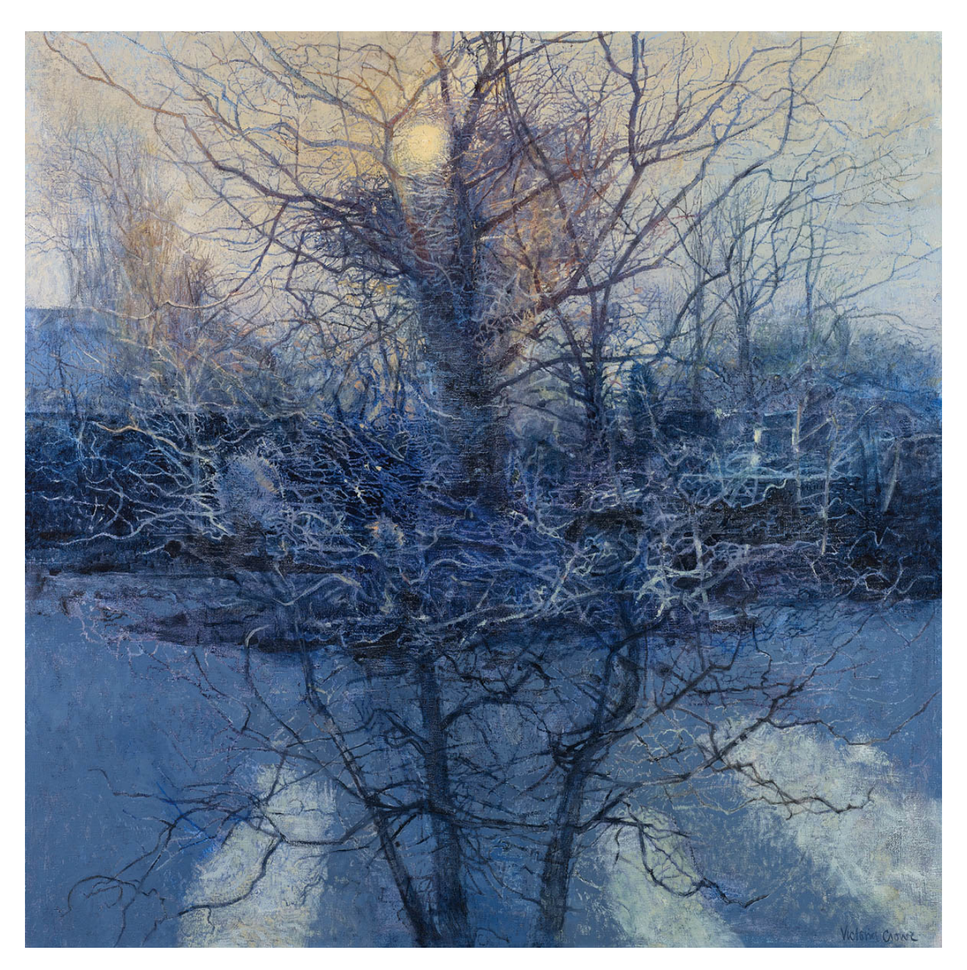
Making All Things New, Victoria Crowe, oil on museum board, 99 \times 140 cm. Frost Light, Victoria Crowe, oil on linen, 91.5 \times 91.5cm

The pandemic struck immediately after Crowe's 2019 retrospective exhibition at the City Art Centre; with freedom limited as the country locked down, Crowe was also struggling with serious illness making this time even more poignant. The twelve paintings seen here represent her return to work in her West Linton studio; Crowe took advantage of the lack of social contact, using the quiet to immerse herself more easily in the process of painting.