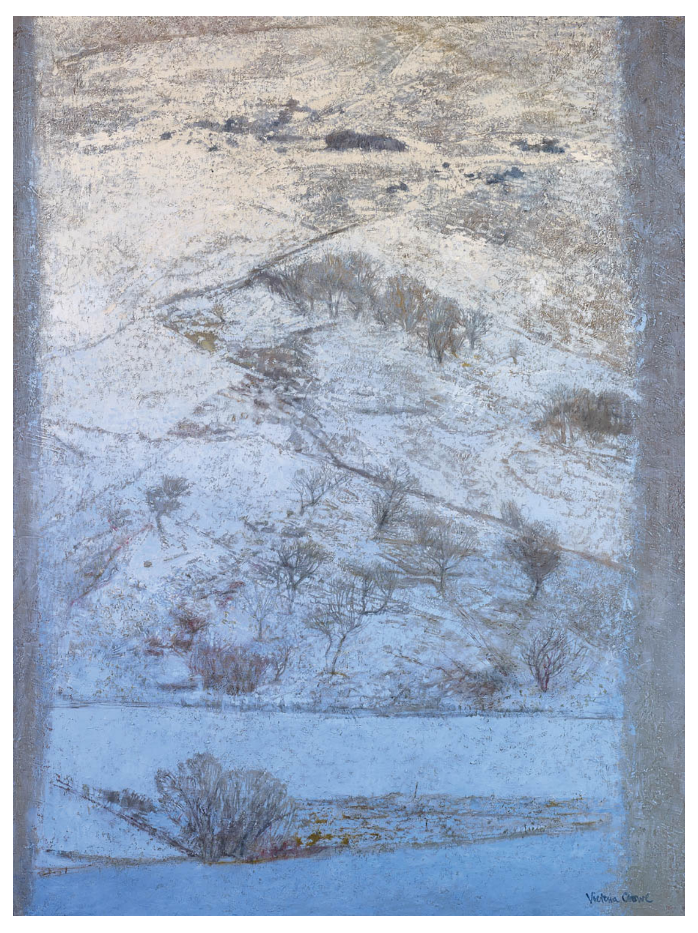
The Amazing Clarity of the Night Skies, Victoria Crowe, oil on linen, 130 \times 110 \, \text{cm} . Shadow Flying over Snow, Victoria Crowe, oil on linen, 102 \times 76.5 \, \text{cm}