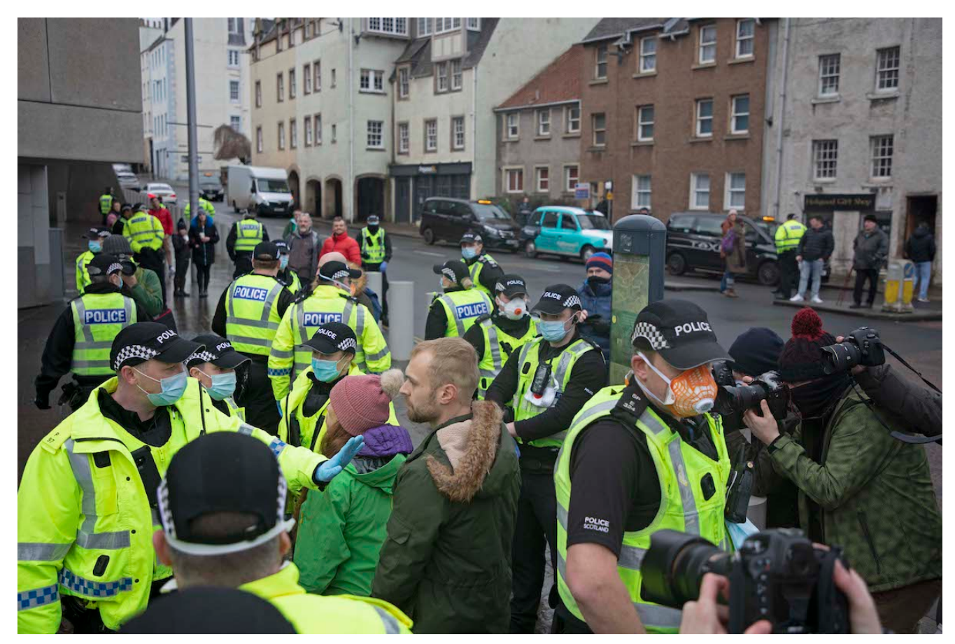
Holyrood 11 January 2021