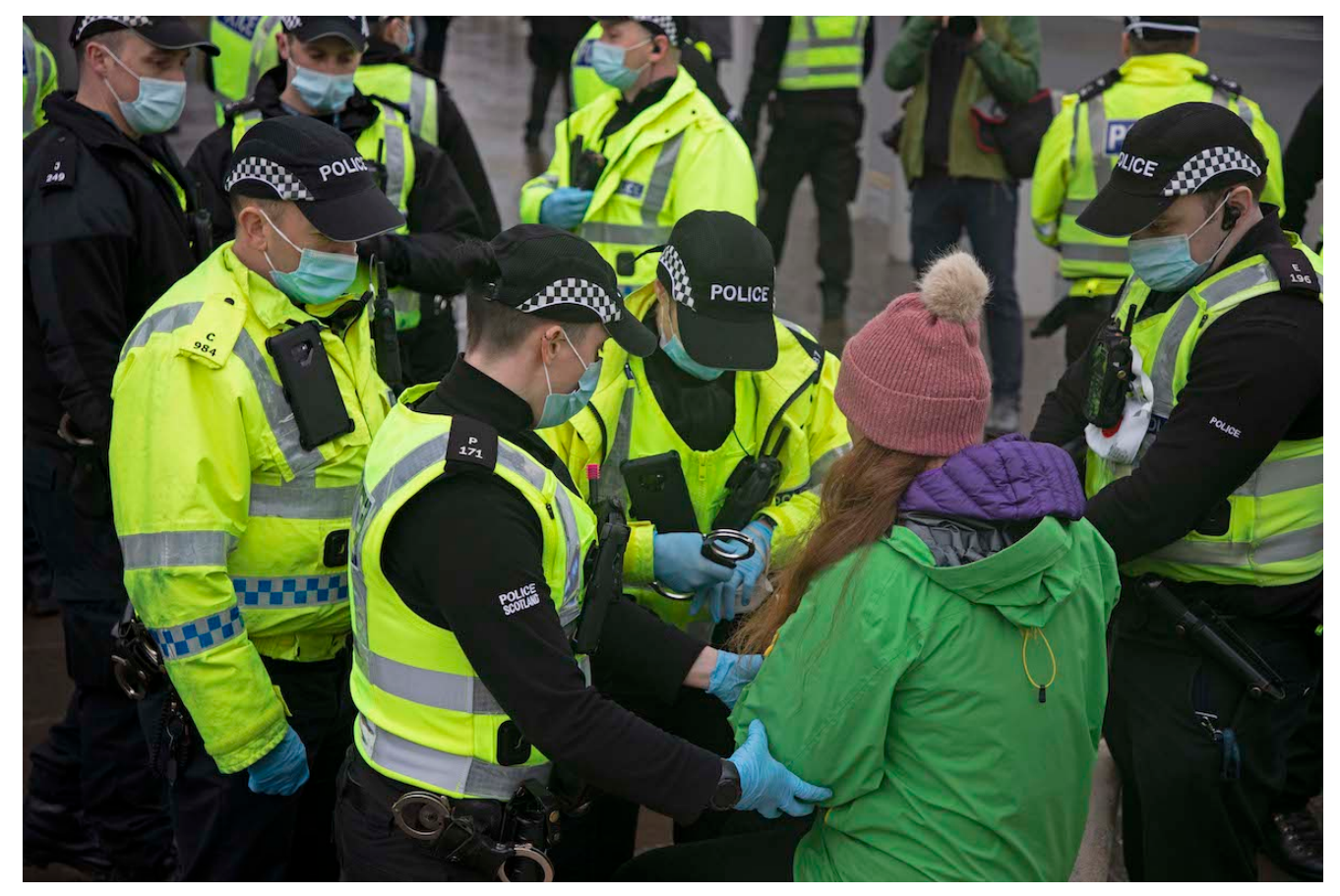
Holyrood 11 January 2021

A police officer is heard advising that as the women did not move on following a warning they would receive penalty tickets, then they are seen, apparently handcuffed, being moved towards police vehicles. The other woman shouted loudly that she was being kidnapped, which was countered by a woman police officer who told her she was not being kidnapped.