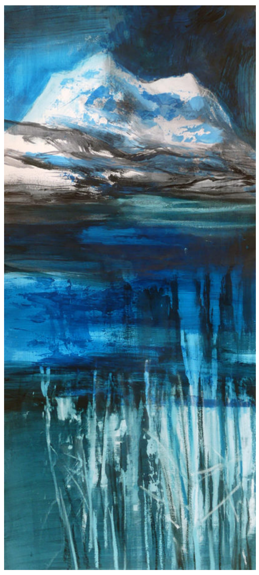
Liz Myhill. Ice Edge Loch (Wester Ross) Mixed media on paper 55 x 24 cm £680 (framed)