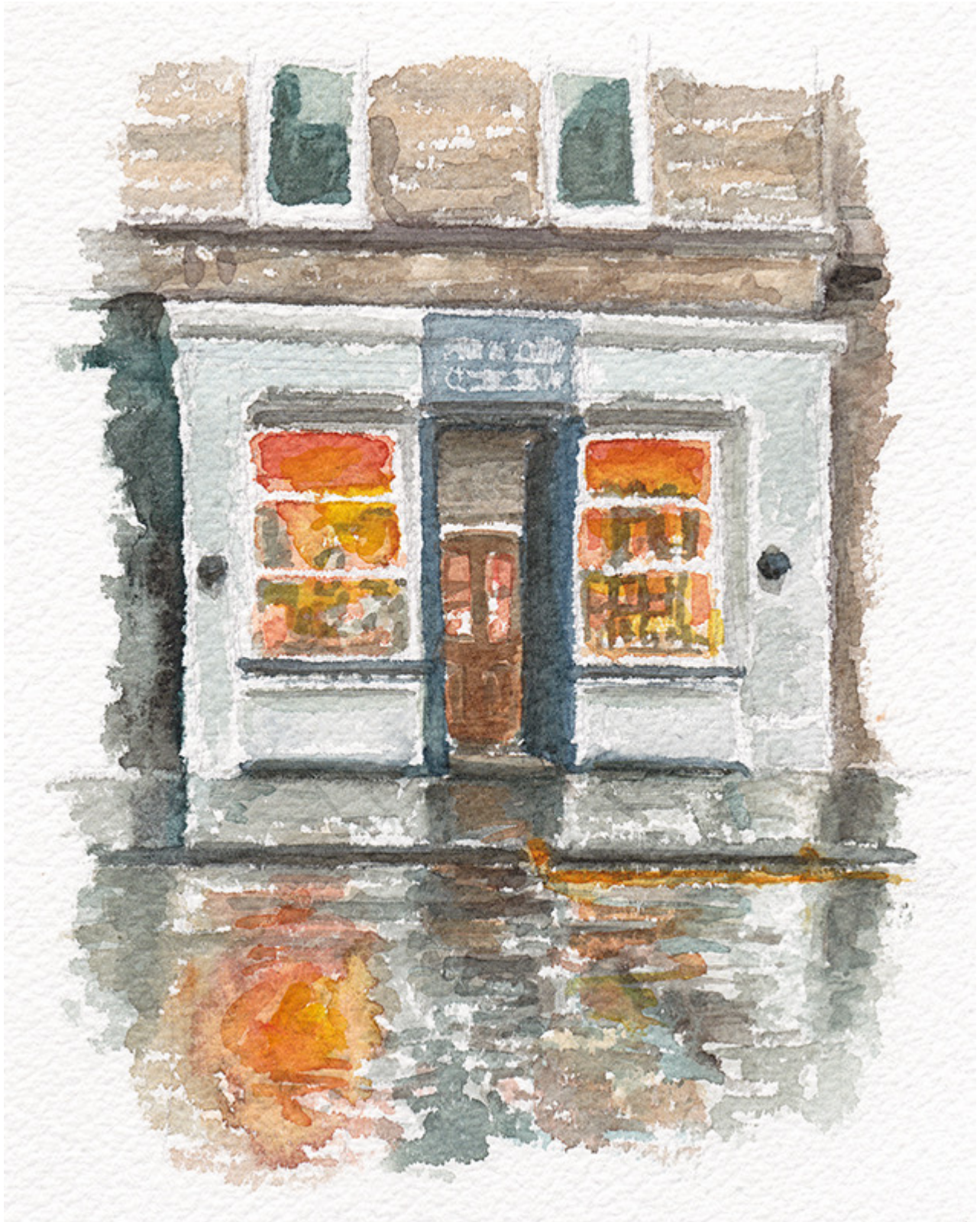
A sketch from the Edinburgh Sketcher whose work you will find at Art & Craft Collective