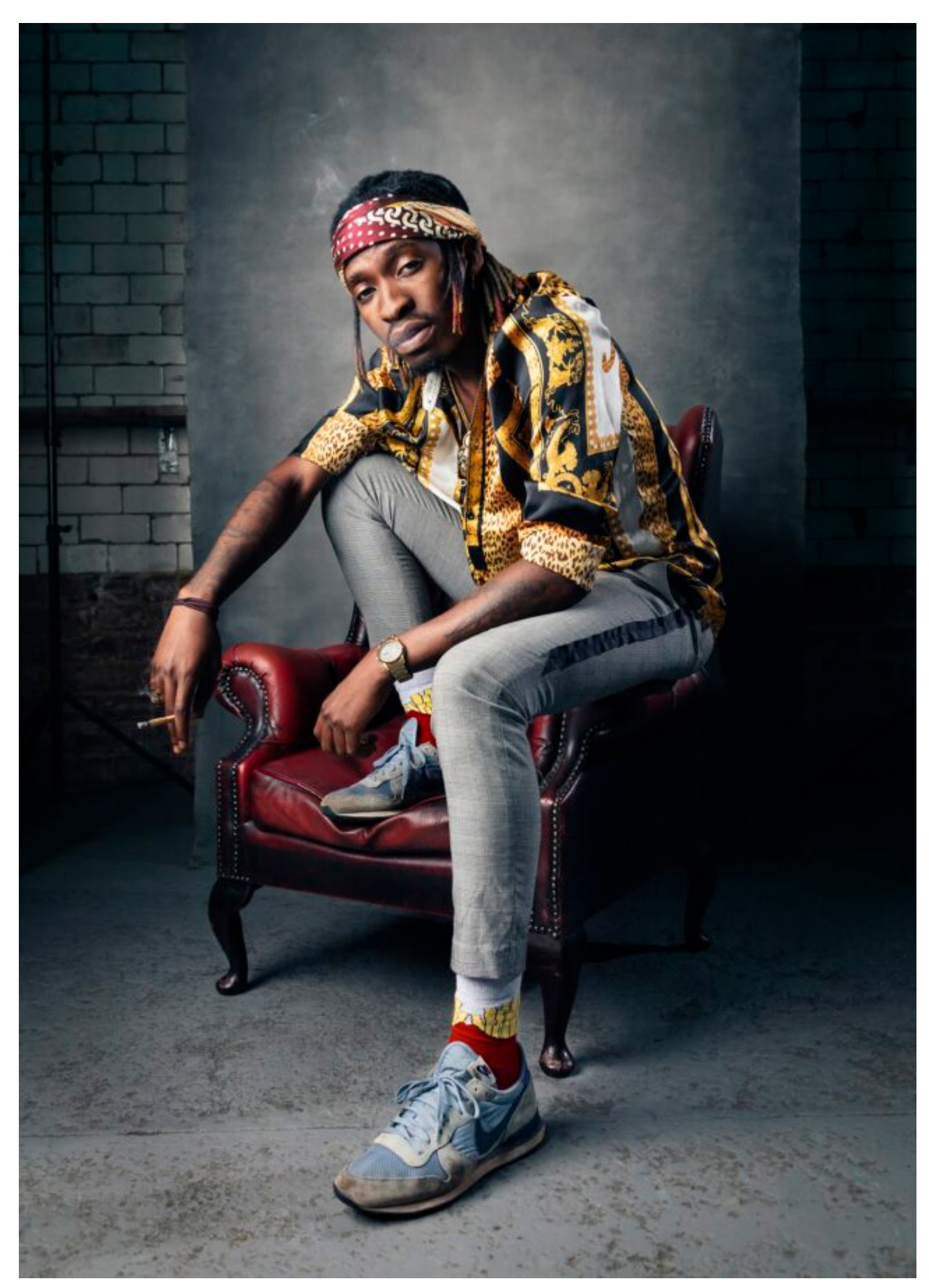
Focus — <a href="https://www.pennmann.co.uk">www.pennmann.co.uk</a> Both online tutorials focus on building skills and understanding of high-end retouching and post-processing of