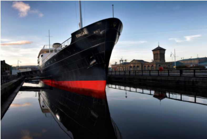
Fingal in Leith

The destinations they can help you with include the iconic highland hotel, The Torridon, The Royal Yacht Britannia's sister ship, Fingal in Leith, and the unrivalled country estate with world-famous golf, Gleneagles.