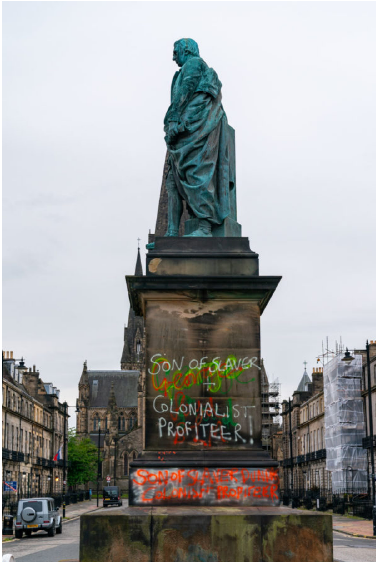
Robert Viscount Melville.

Robert was an MP for Midlothian, a governor of the Bank of