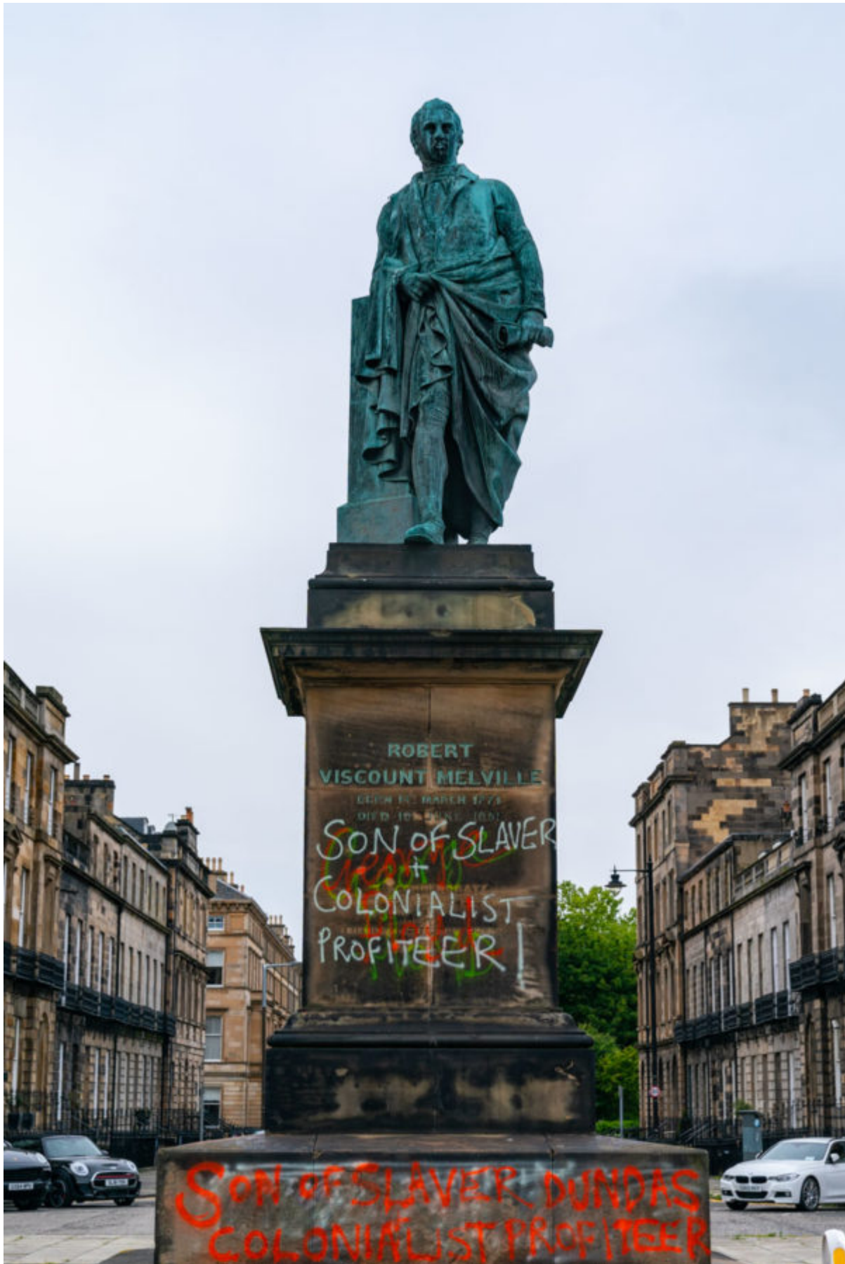
Robert Viscount Melville.