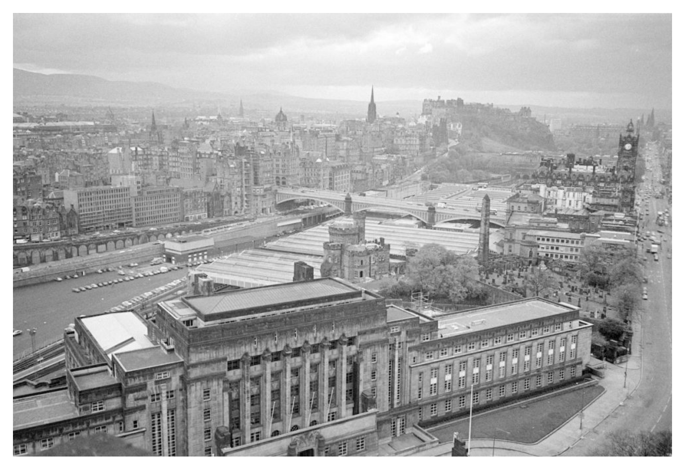
St Andrew's House across to the Old Town 1985

The collection gives a rare insight into what life was like throughout Scotland at that time with pub interiors, fashion trends and interior design choices all documented. There are also extensive records of Glasgow and Edinburgh and nearby locales, as well as Scotland's new towns. Over 5,000 images of locations and building exterior and interiors are currently unidentified as part of this collection, and HES need help in identifying as many as possible with the help of the public.