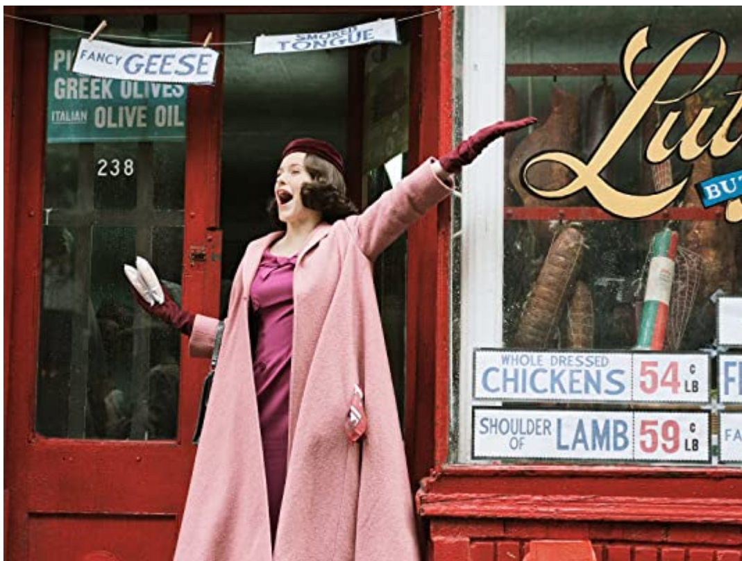
Rachel Brosnahan is Midge Maisel

The Marvelous Mrs. Maisel is the winner of sixteen Emmy Awards including Outstanding Comedy series, three Golden Globes including Best TV Series–Comedy, five Critics' Choice Awards including Best Comedy Series, two PGA Awards, a WGA Award, and a Peabody Award.