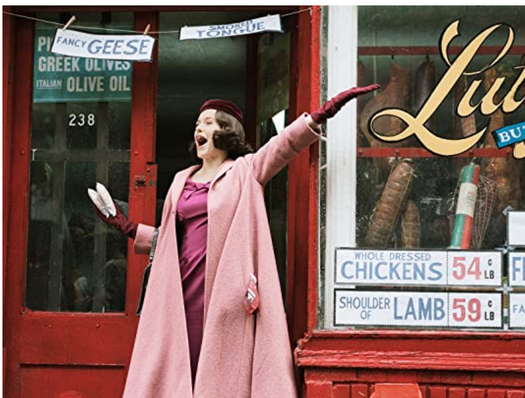
Rachel Brosnahan is Midge Maisel

The Marvelous Mrs. Maisel is the winner of sixteen Emmy Awards including Outstanding Comedy series, three Golden Globes including Best TV Series–Comedy, five Critics' Choice Awards including Best Comedy Series, two PGA Awards, a WGA Award, and a Peabody Award.