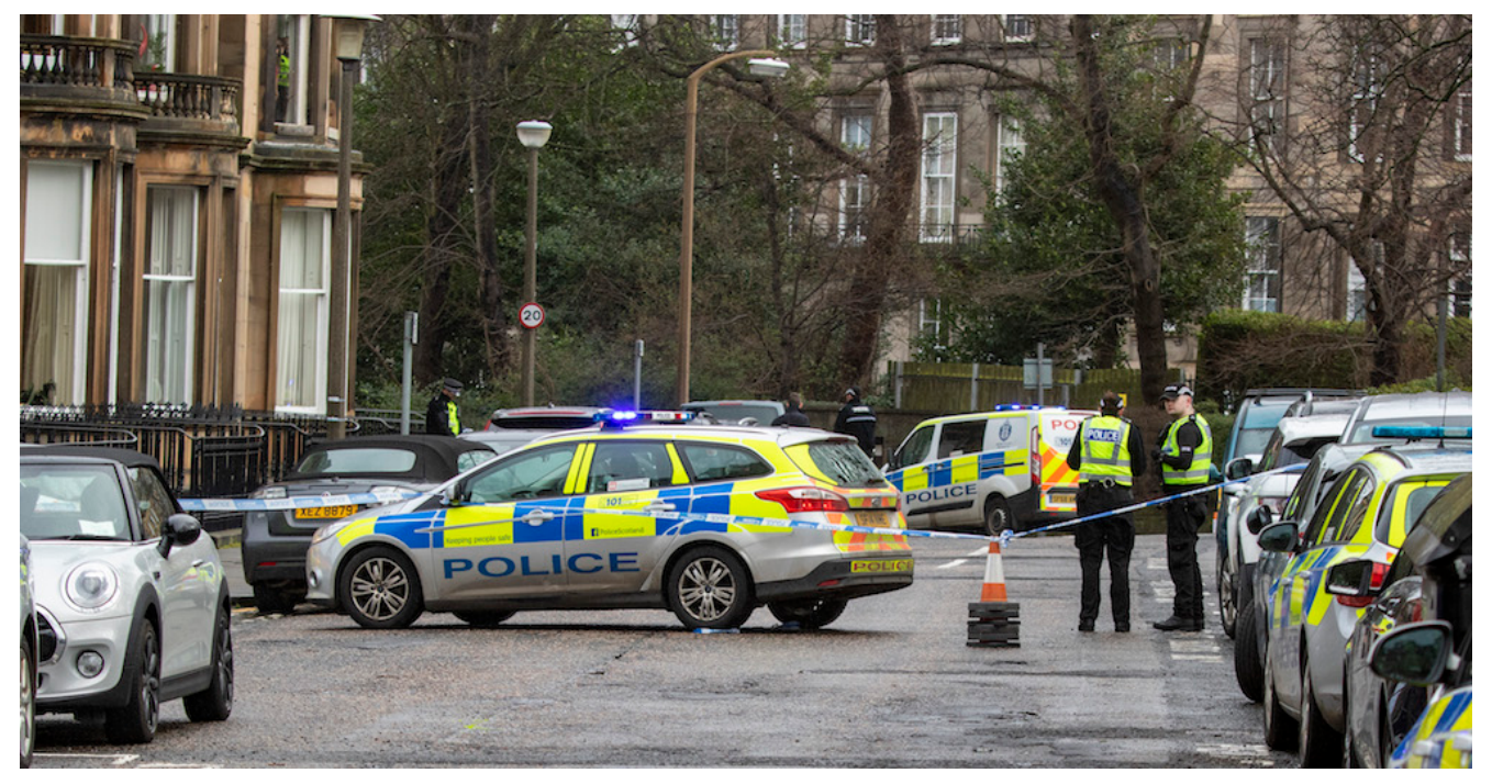
EDINBURGH — 1 MARCH 2020. Police officers stand guard at Learmonth Terrace, Edinburgh after a man was found injured in the street at 9.50am on Sunday March 1 2020.

"He has been taken to hospital and enquiries are ongoing to establish the circumstances."