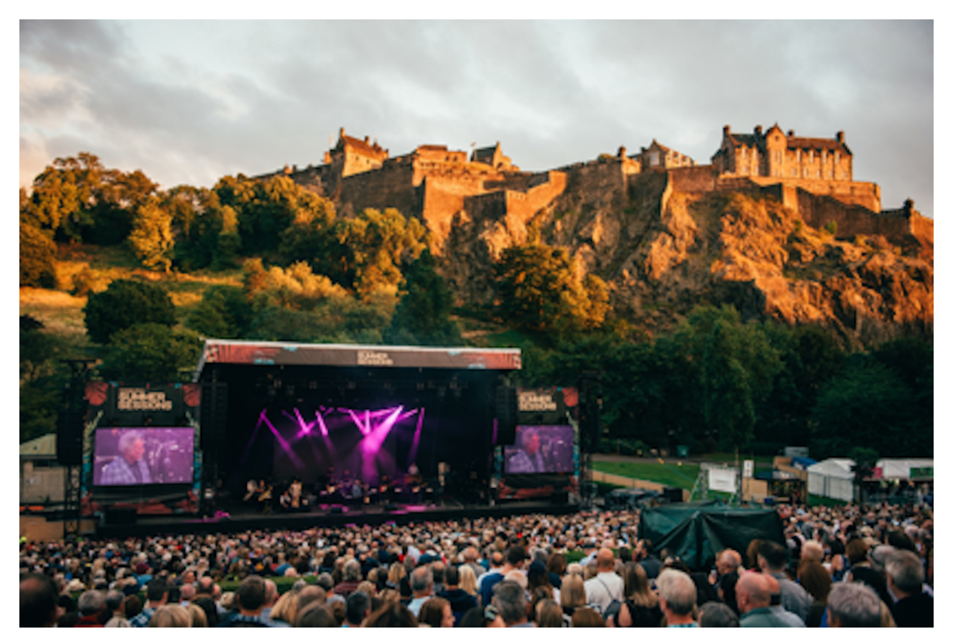
Scotland's most successful rock band ever, Simple Minds, join the 2020 line-up as they headline on 18^{\text{th}} August 2020.

With one of the most iconic back catalogues in the world and celebrating 40 years of hits this year, the legendary Glasgow band are responsible for huge anthems that will go down a storm with the Edinburgh Summer Sessions crowd, like the classic 'Don't You (Forget About Me)' 'Alive and Kicking' and 'Belfast Child'.