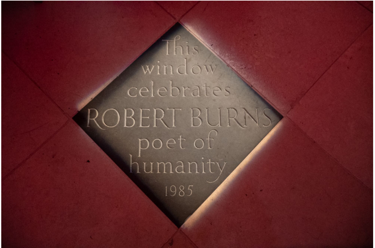
In St Giles Cathedral