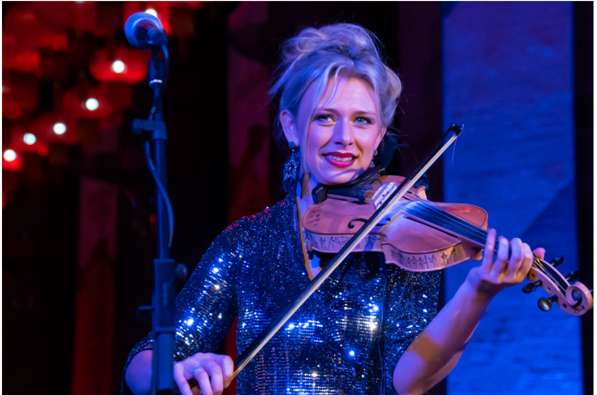
Kinnaris Quintet played at the Burns and Beyond launch in St Giles