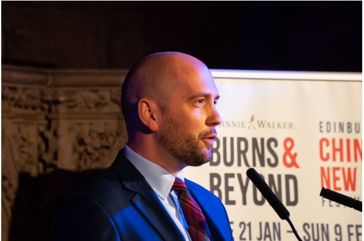
Minister Ben Macpherson speaking at Burns and Beyond