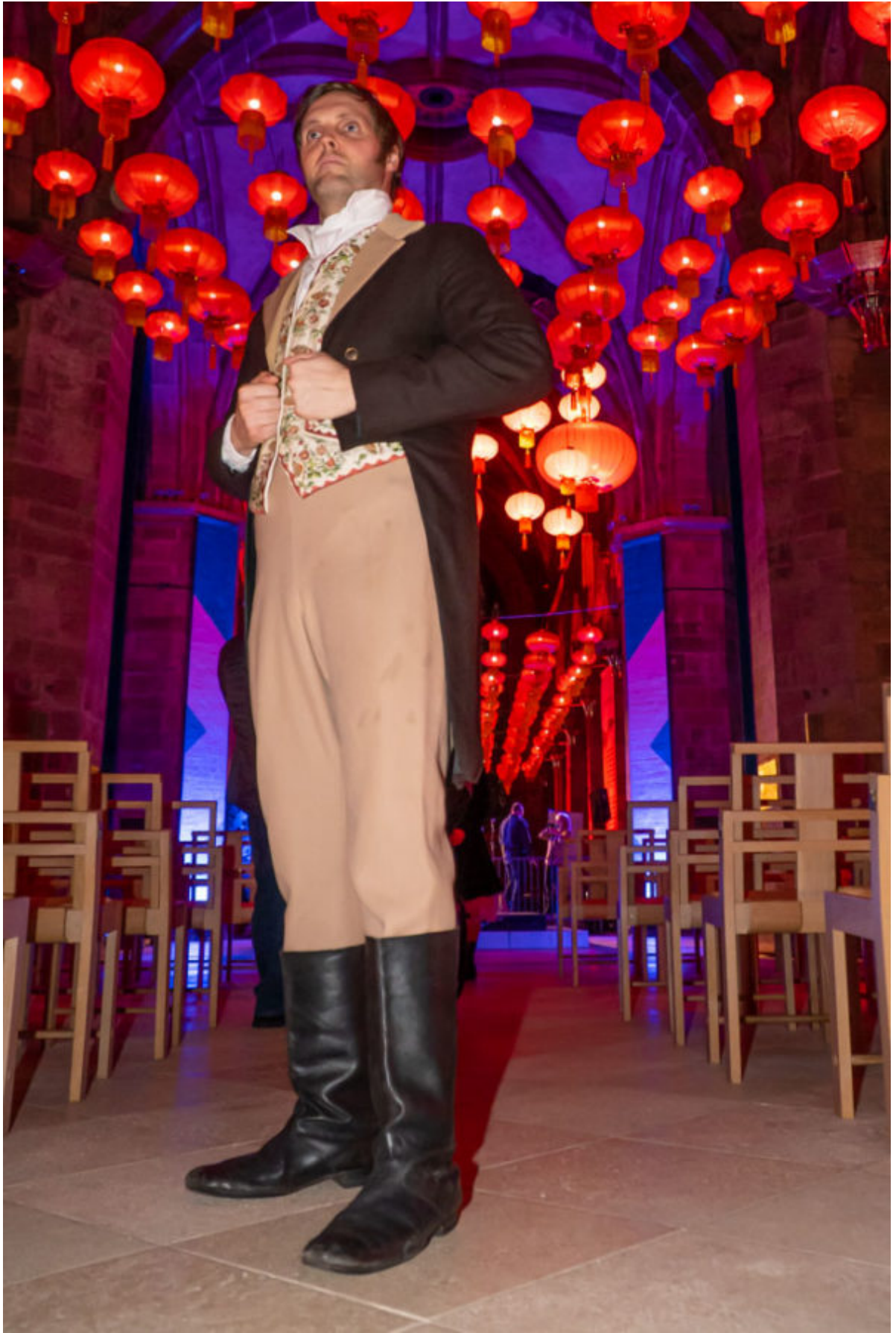
Robert Burns