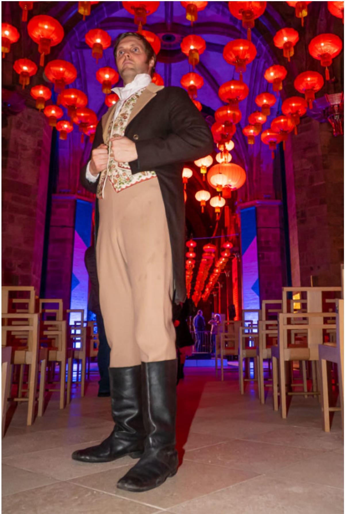
Robert Burns