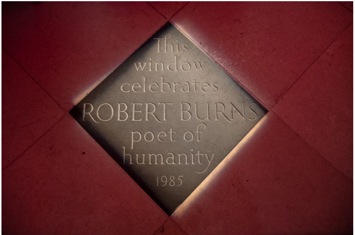
In St Giles Cathedral