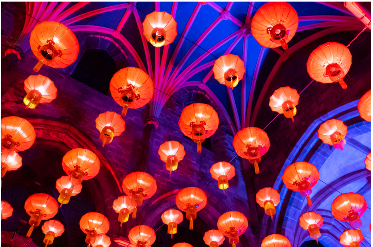
Some of the 400 lanterns Burns and Beyond launch