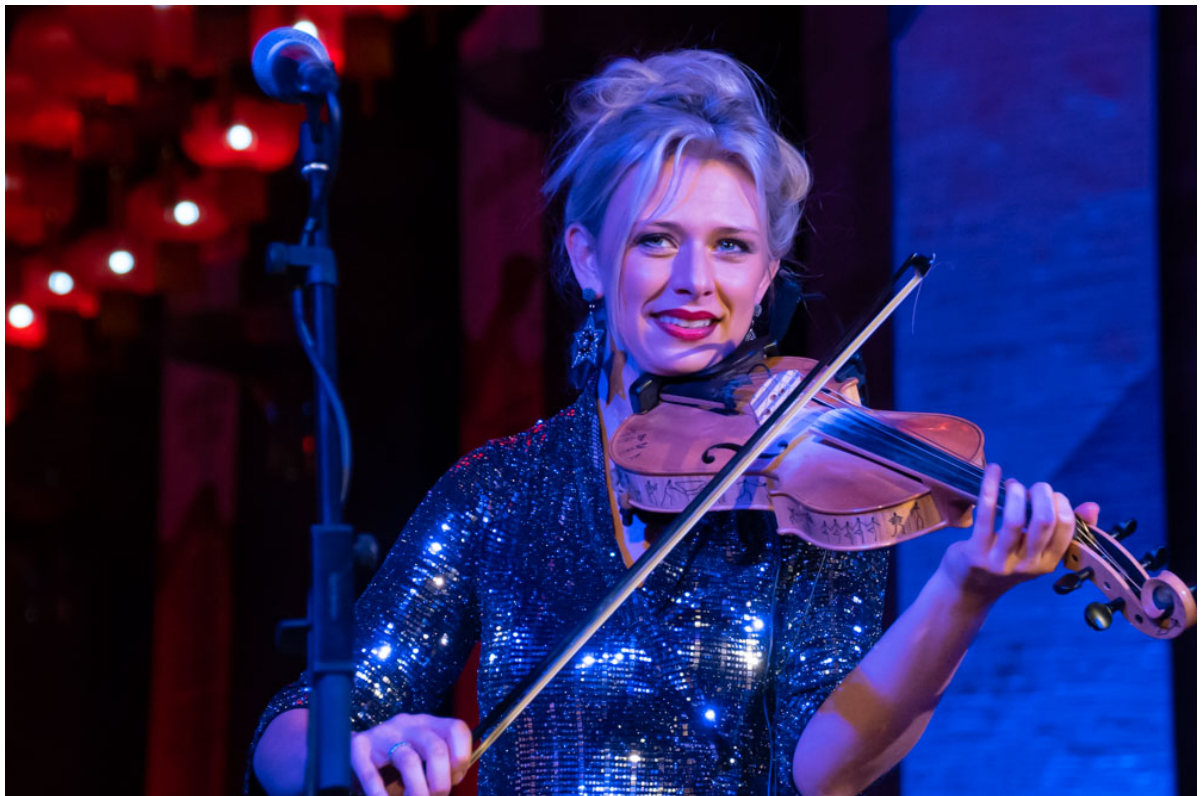
Burns and Beyond.