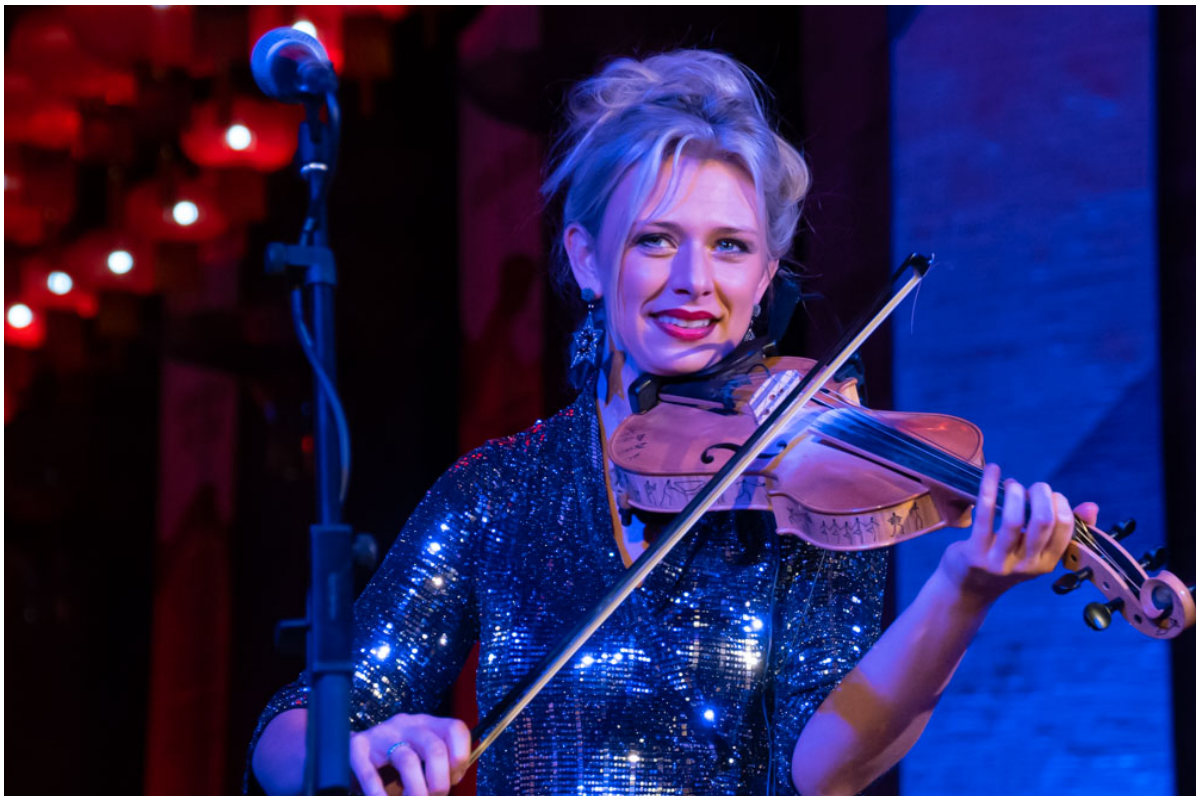
Burns and Beyond.