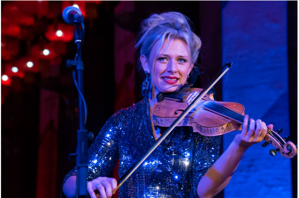
Kinnaris Quintet played at the Burns and Beyond launch in St Giles