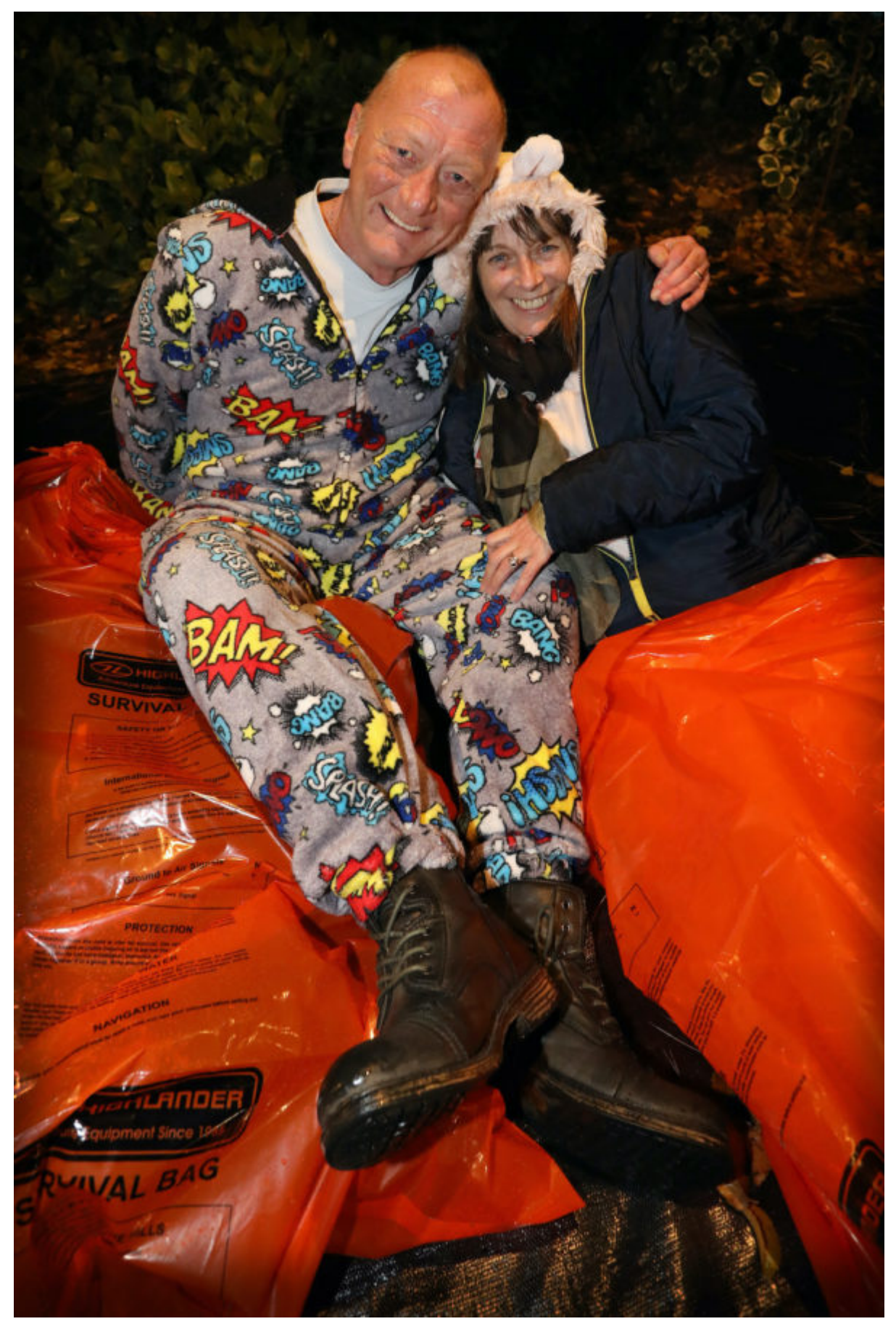
The World's Big Sleep Out : Edinburgh's leg of the World's Big Sleep Out, Princes St. Gardens, Saturday 7th December. People taking part in the Edinburgh's leg of the World's Big Sleep