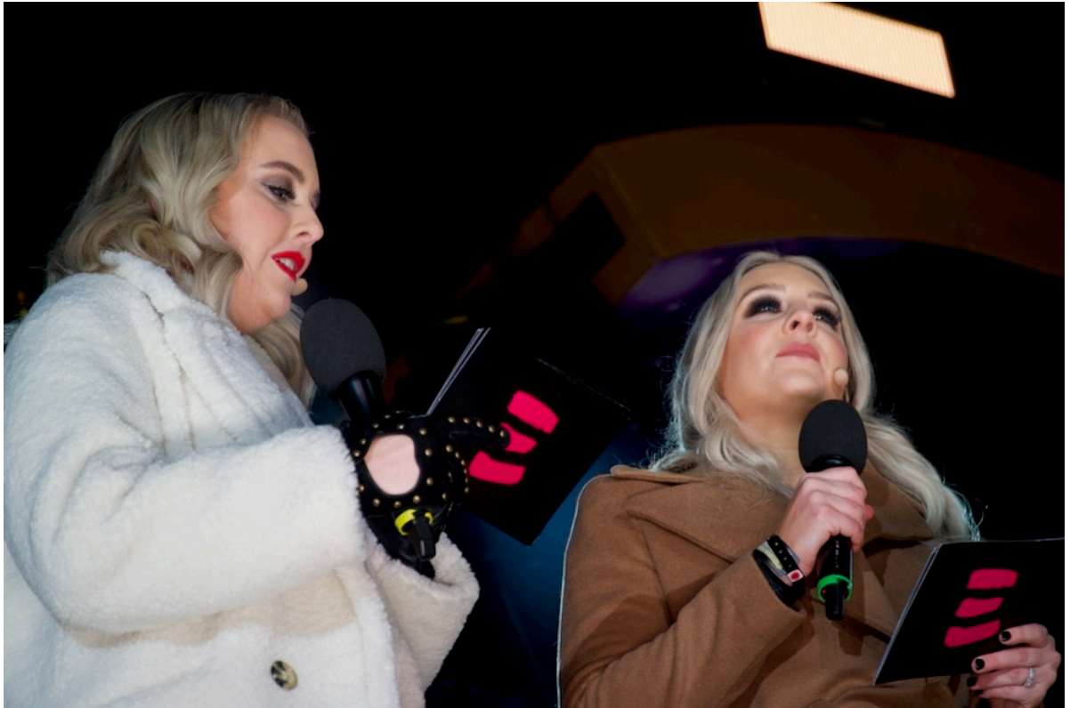
The Mac Twins