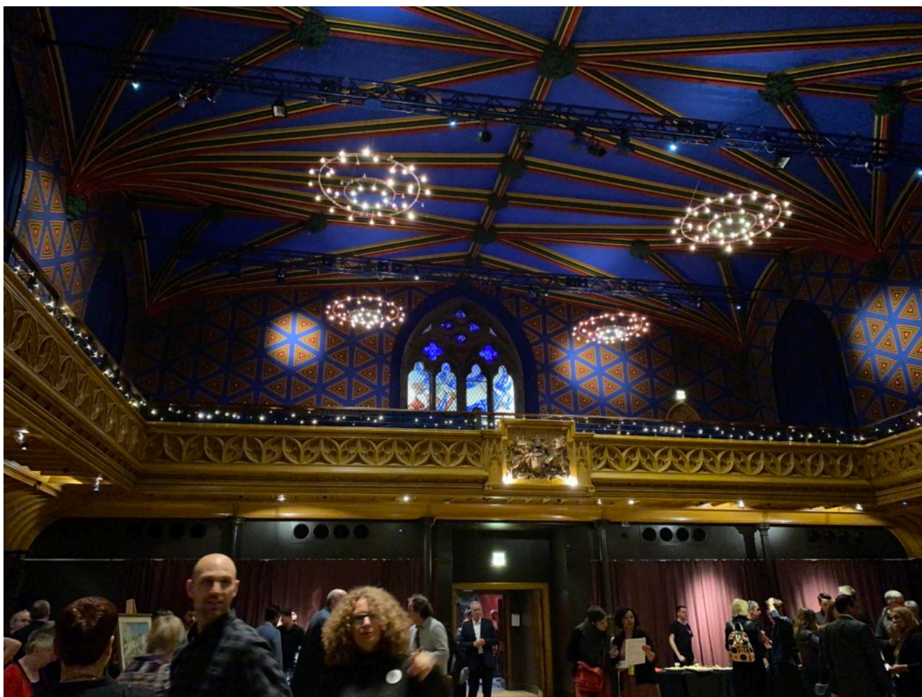
North Edinburgh Arts held a fundraising event at The Hub in

The evening was held to celebrate the seventeen years since NEA began and the funding will be used to resource the Artists' Studios at North Edinburgh Arts which need new materials, easels, furniture and fund a programme of art activities and events.