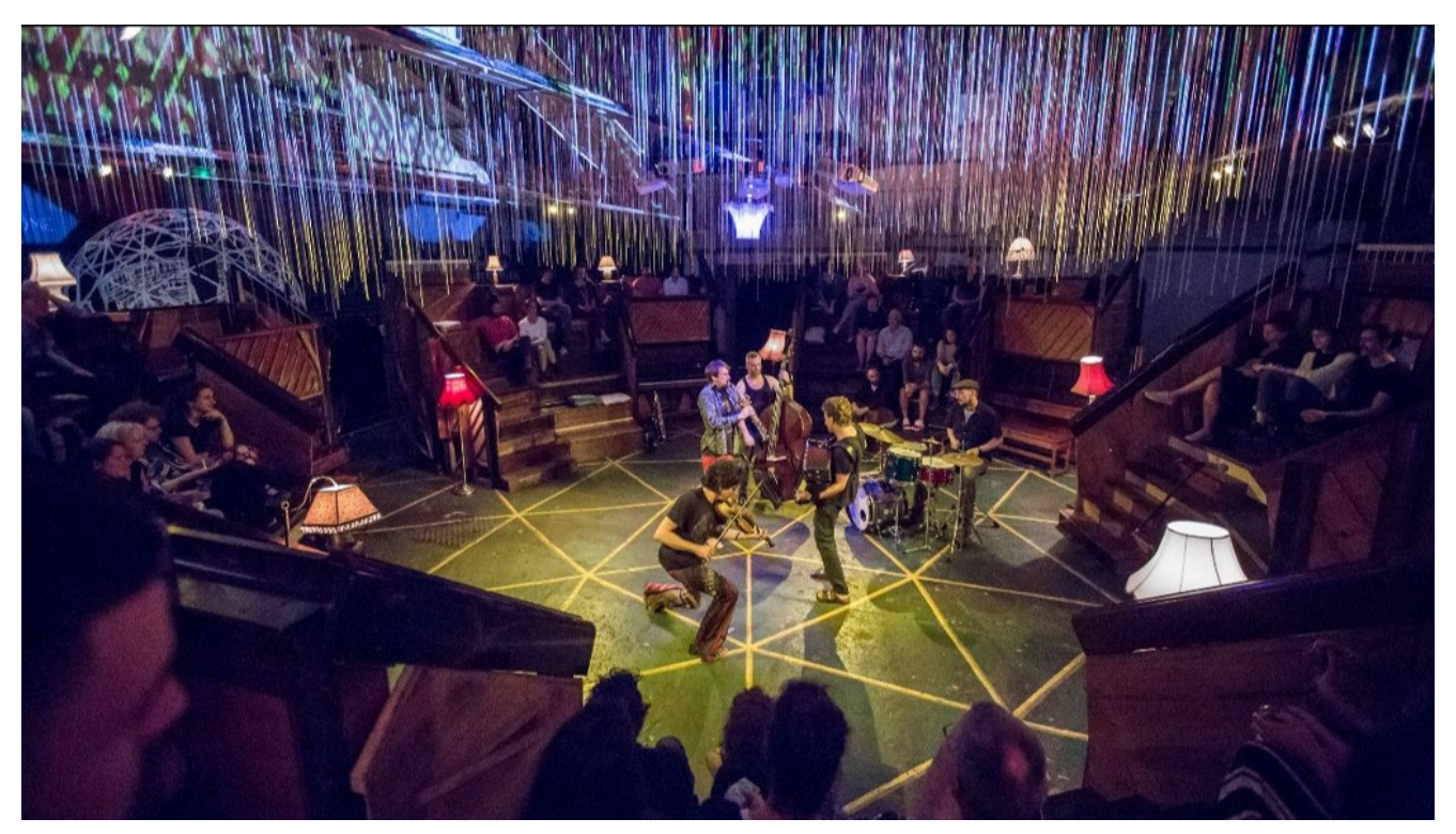
LeithLate19 November 2019 events include Moon Party at the Leith Theatre